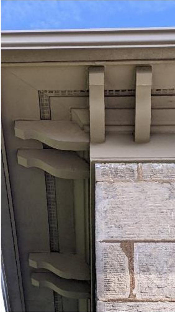
Roof Brackets at Corner

Decorative cornice and roof brackets at protruding eaves