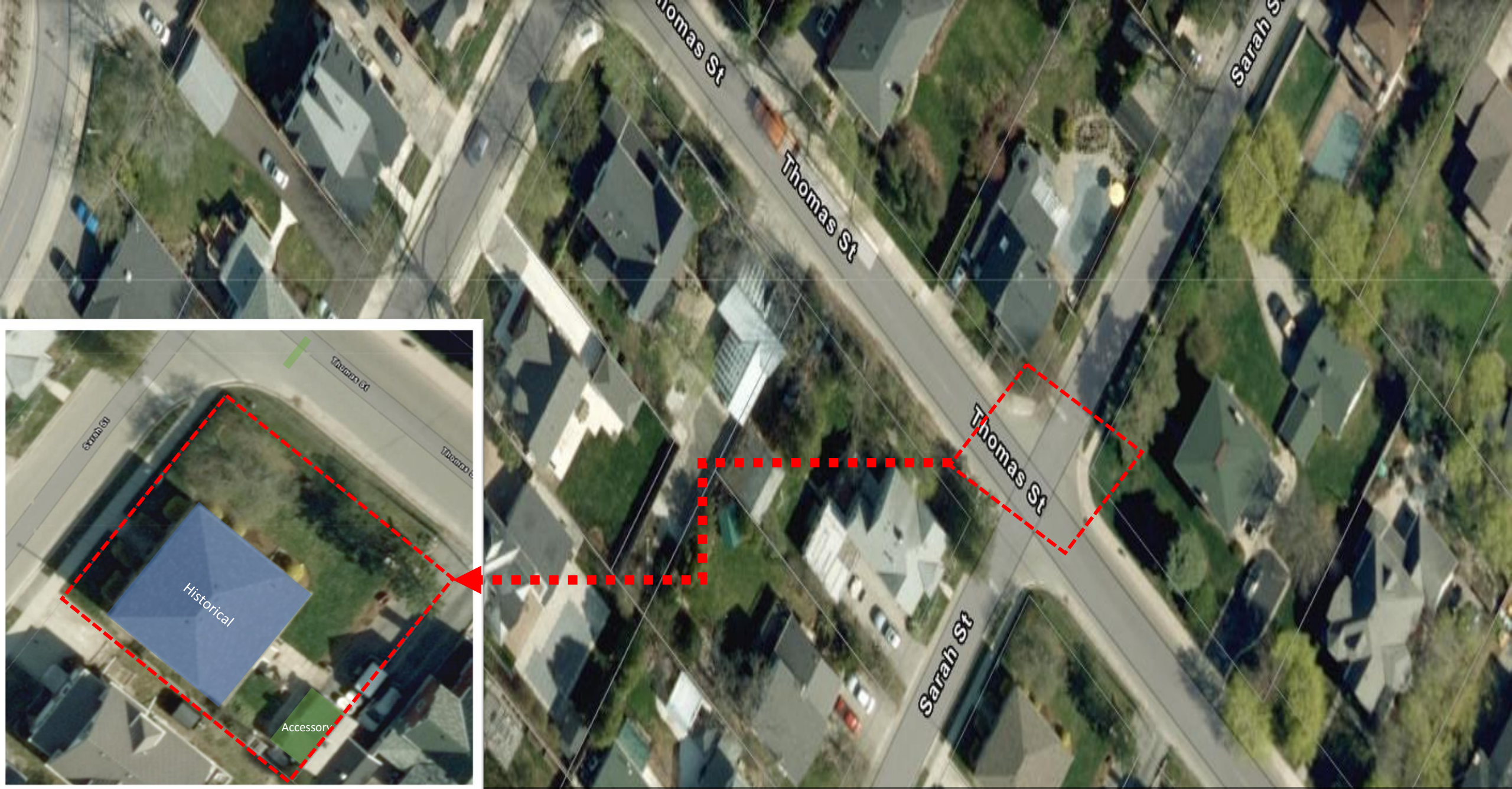
Location Map_ 193 Queen Street