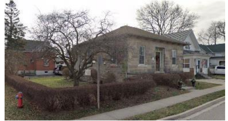
North East Elevation 2014