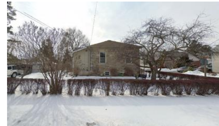
South Elevation 2022