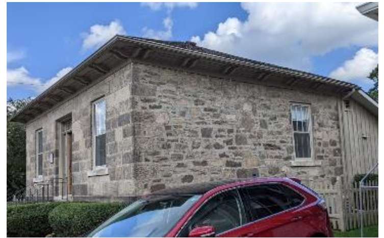
West Elevation Stonework