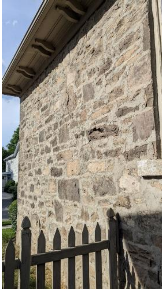
Random Field at East Elevation