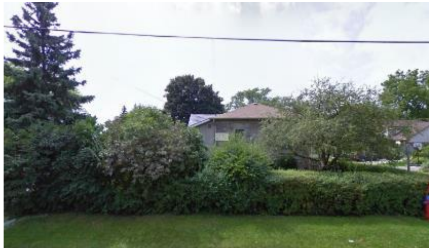
South Elevation 2009