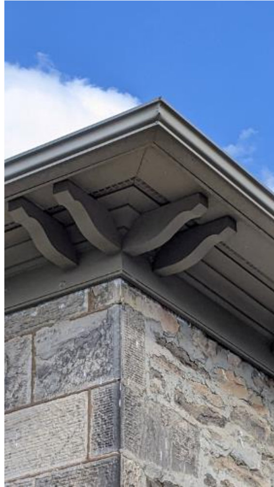
Roof Brackets at Corner