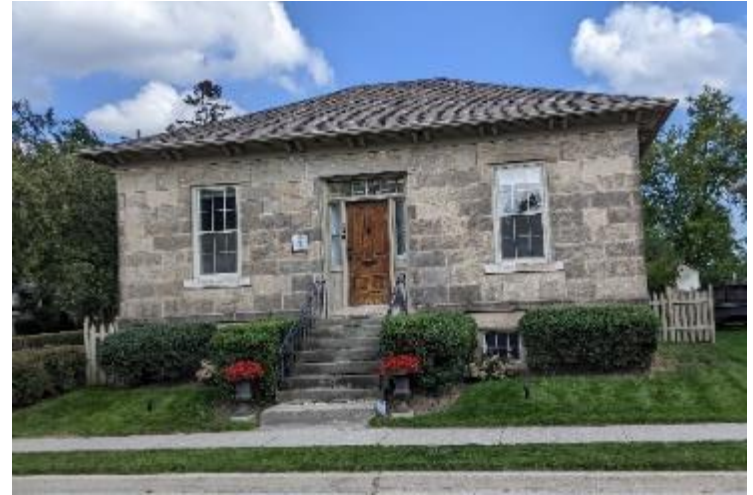
North Elevation Stonework