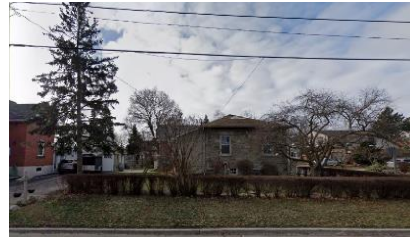
South Elevation 2014