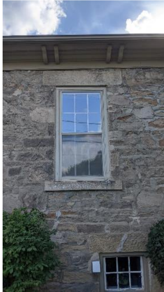
Brick Chimney at West Elevation