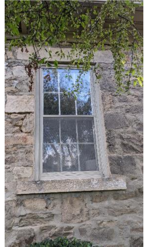
Brick Chimney Base