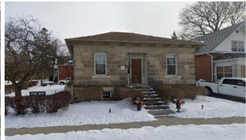
North Elevation 2020