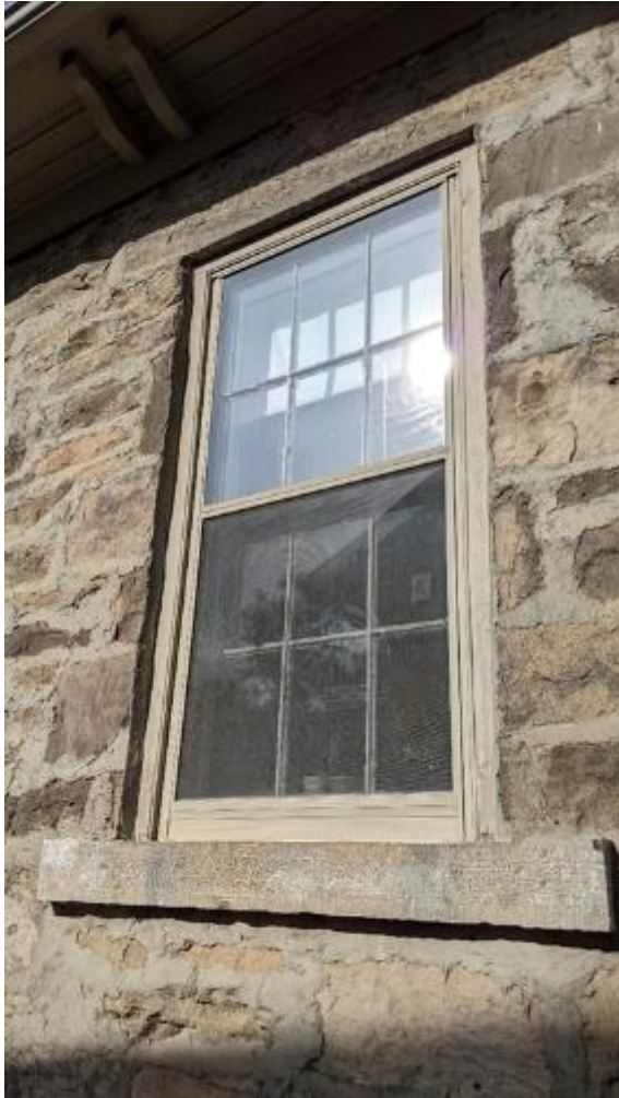
West Elevation Window

Six over Six windows with stone lug sills and lintel