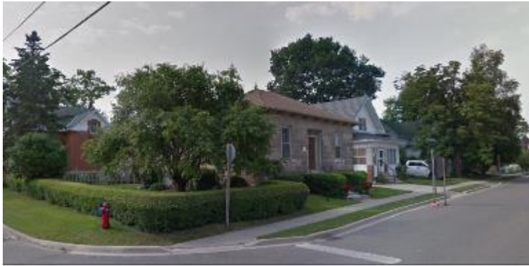
North East Elevation 2016