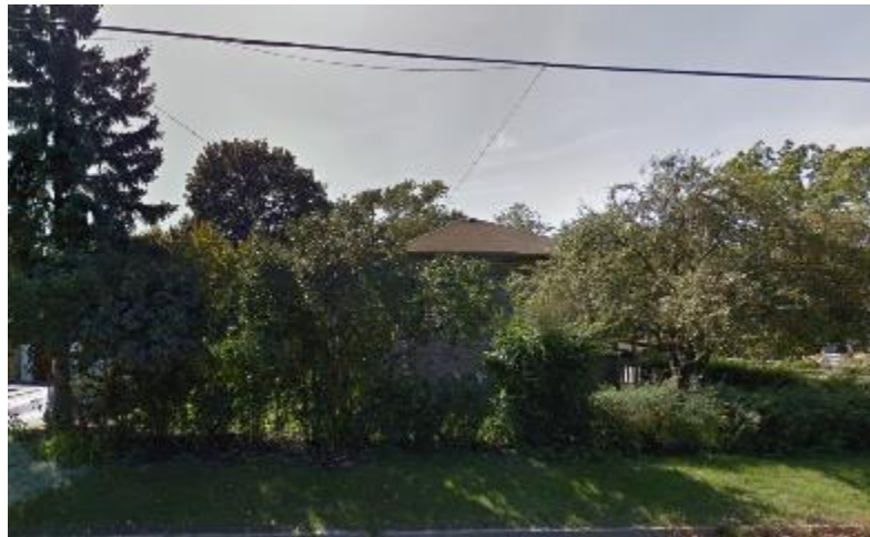
South Elevation 2012