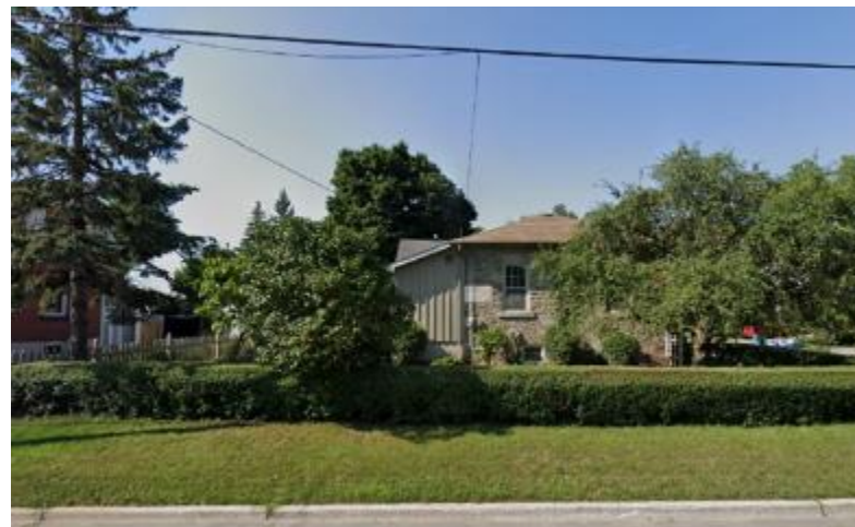
South Elevation 2020