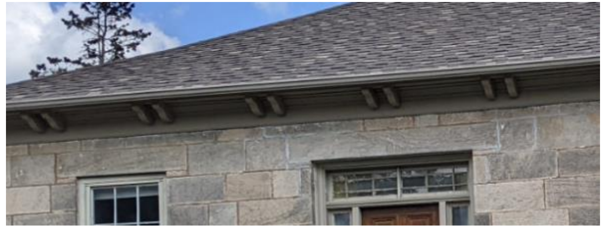
North Elevation Roof Cornices