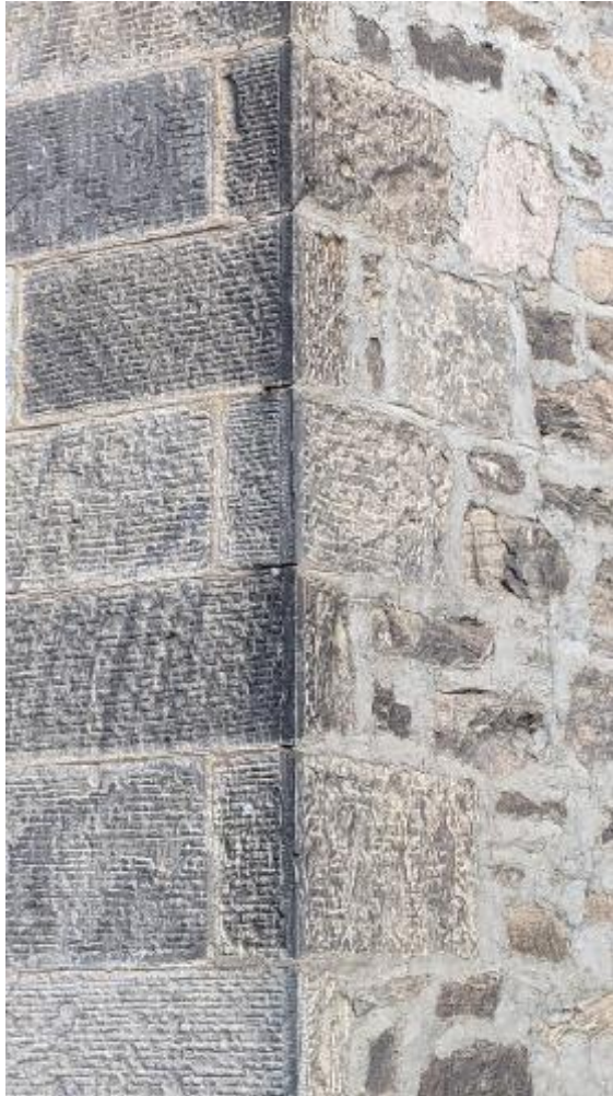
Detail at Corner

Course cut stone on the Northern elevation and random field stone other sides