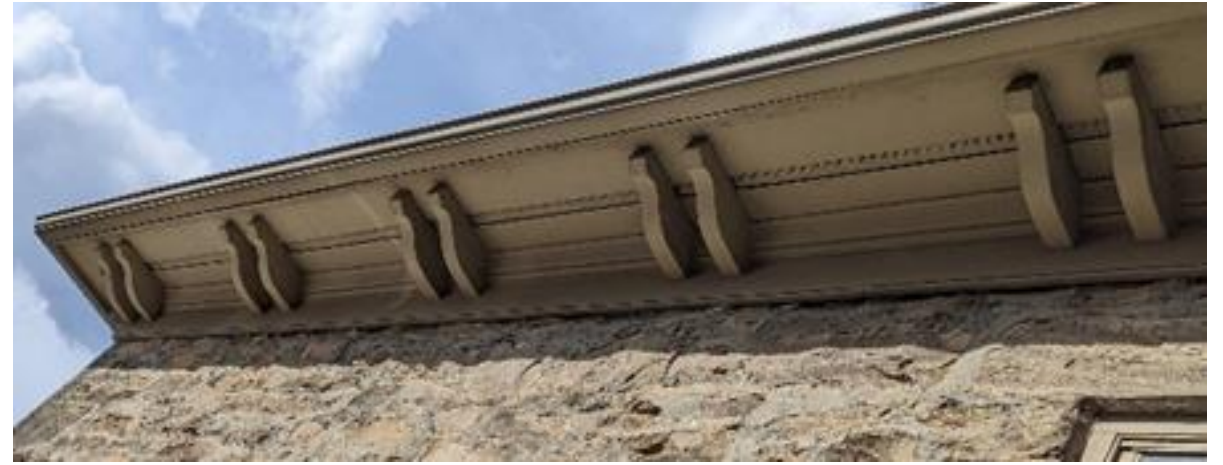
East Elevation Roof Cornices