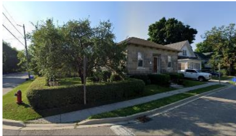
North East Elevation 2018