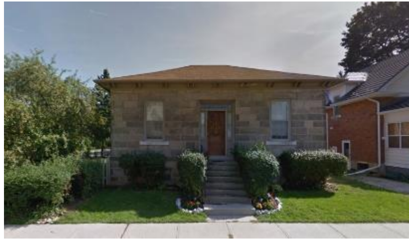
North Elevation 2012