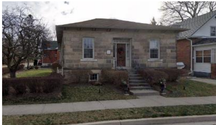
North Elevation 2018