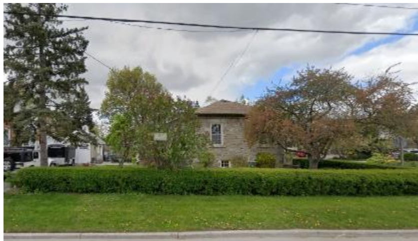
South Elevation 2018