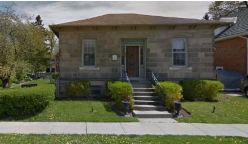
North Elevation 2016