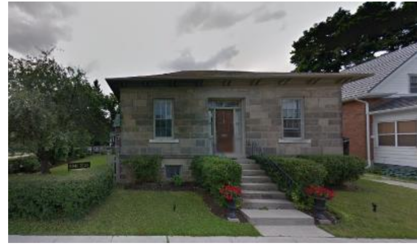
North Elevation 2014