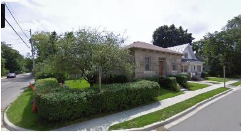
North East Elevation 2009