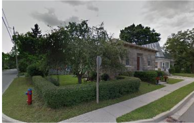
North East Elevation 2012