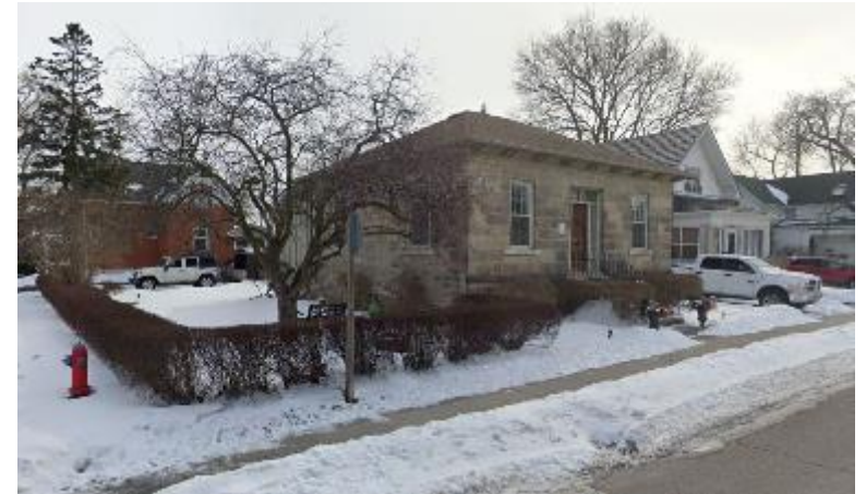
North East Elevation 2020