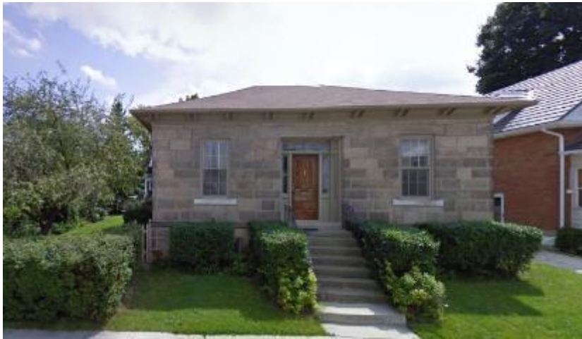
North Elevation 2009