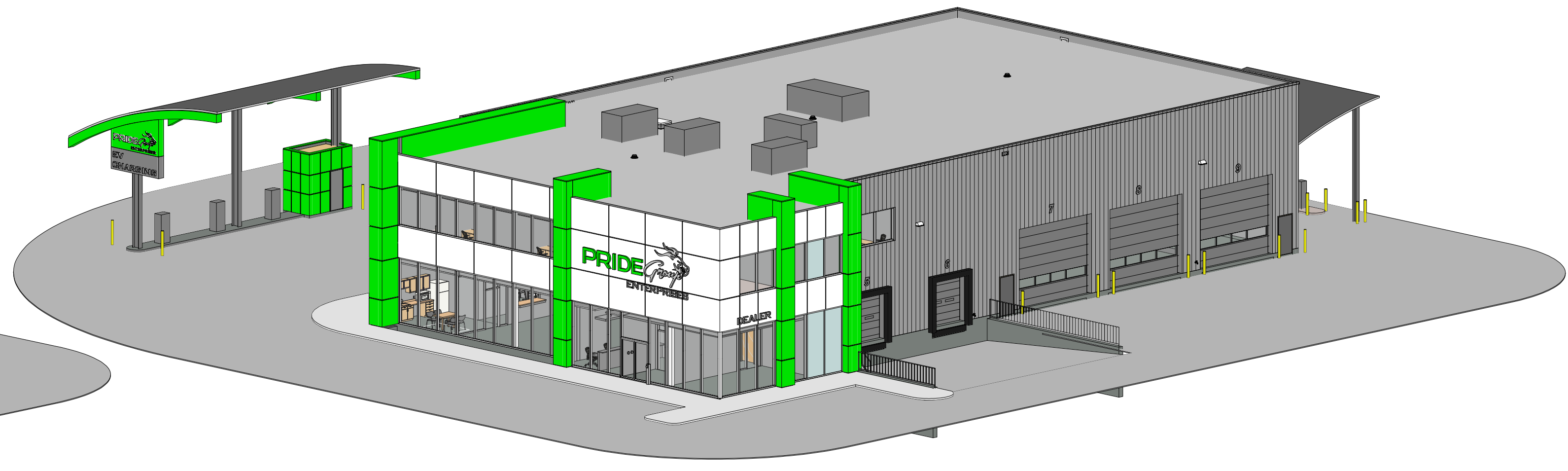
1 SOUTH-EAST VIEW A202