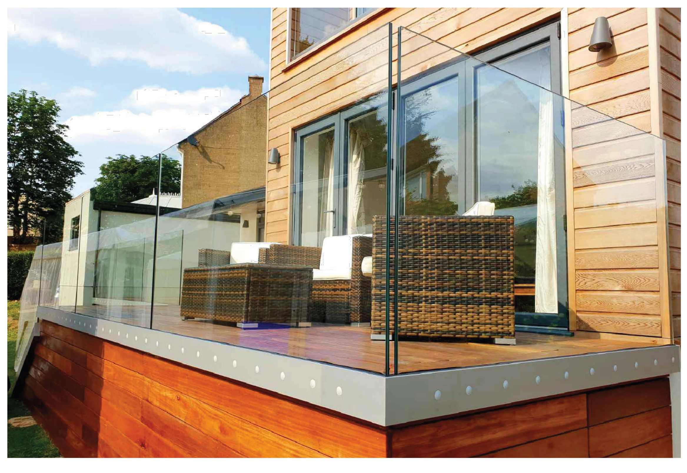
3 GLASS GUARD RAIL AND GATE (TO POOL CODE)

2 EXISTING 6' WOOD FENCE (ENTIRE PERIMETER REAR GARDEN) 1:20