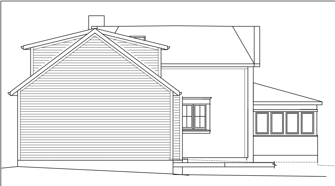
3 Existing Back (West) Elevation Scale: 1/8"=1'-0"

Copyright Matthews Design & Drafting Services (MDDS) 2011. No person may copy, reproduce, distribute or alter this plan in whole or in part without the written permission