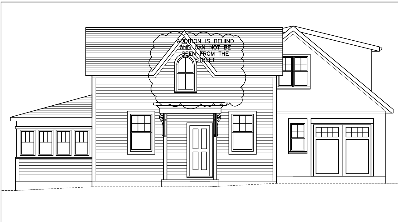
2 Existing Front (East) Elevation Scale: 1/8"=1'-0"