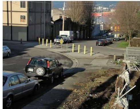
Figure 14 – Diverter