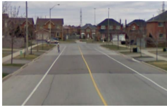
Figure 10 - Road Diet, Mississauga, ON

Road diets are a new technique used to better define road space for various users and to encourage motorists to slow down. In many cases, wide local and collector streets do not have pavement markings (other than a centre line in the case of collectors) to clearly indicate where motorists should drive. Road diets involve the addition of pavement markings to define driving space, parking space, and, in some cases, bicycle facilities. More clear definition of driving space can induce drivers to reduce their speed. Road diets can be applied to local and collector roadways.