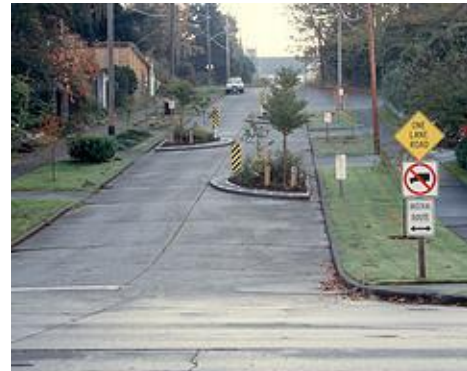
Figure 5 - One-Lane Chicane 12

A one-lane chicane is most applicable to the Town of Milton's application on local and minor collector roadways that are not designated transit or emergency routes.