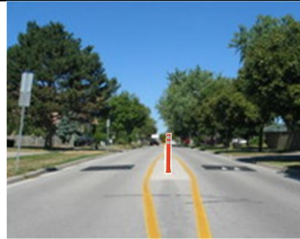
Figure 1 - Speed Cushions with Mountable Centre Median 8 , Oakville, ON

Speed Cushions are small speed humps designed to slow passenger vehicles but are typically designed so that the wheel base of emergency vehicles straddle the speed cushion. The wider wheelbase on emergency vehicles allows them to pass over the speed cushion without slowing down. Speed cushions can be sized and designed in sets of 2-3 cushions (one in the middle and one on each side). Another technique is to use a mountable centre island design with a 'knock-down' post in the middle (shown in picture below). The separation between speed cushions is designed with enough space for emergency vehicles to avoid touching the speed cushions and thus not having to slow down. Speed cushions may be used on local and collector roadways with design modifications tailored to suit individual roadway dimensions to ensure smooth passage for emergency and transit vehicles.