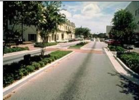
Figure 8 - Raised Median (with Textured Crosswalk) 13

Raised median islands are installed in the centre of a roadway to reduce the overall width of the travelled lanes. They help slow traffic without affecting the capacity of the road. Raised median islands can be combined with curb extensions and/or textured crosswalks to further improve pedestrian safety. This measure may be considered on both local and collector roadways.