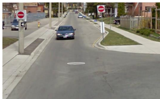
Figure 11 - Directional Closure, Kitchener, ON

Directional closures are created using a curb extension or other barrier that extends into the roadway, approximately as far as the centerline. This device obstructs one side of the roadway and effectively prohibits vehicles travelling in that direction from entering. Directional closures are especially useful for controlling non-compliance of one-way road sections and are compatible with other modes such as bicycles. At all directional closures, bicycles are permitted to travel in both directions through the unobstructed side of the road; however, some directional closures have a pathway built through the device specifically for bicycles. Since their purpose is to prevent short-cutting traffic, directional closures are applicable for use on local streets and minor collectors, at their intersection with collectors and arterials.