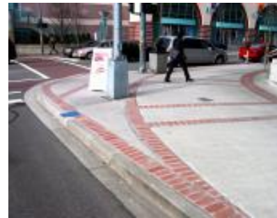
Figure 6 - Curb Radius Reduction

Curb radius reduction is the reconstruction of an intersection corner to a smaller radius. This measure effectively slows down right-turning vehicle speeds by making the corner 'tighter' with a smaller radius. A corner radius reduction may also improve pedestrian safety to a certain degree by shortening the crossing distance. This type of measure is acceptable on local and collector roadways, but its use is often limited to specific situations where the existing intersection geometry would allow the reconstruction. In addition, curb radius reductions should not be used on transit routes requiring a right turn.