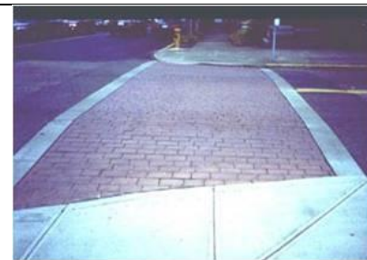
Figure 16 - Textured Crosswalk, Portland, OR

Textured Crosswalks incorporate a textured or patterned surface which contrasts with the adjacent roadway. It helps to better delineate the crossing locations and helps reduce pedestrian-vehicular conflicts. This treatment may be used on both local and collector roadways. Textured crosswalks can be combined with curb extensions and/or raised median islands to further improve pedestrian safety. They should only be used at formal pedestrian crossing locations with painted crosswalk pavement markings such as those found at signalized or stop controlled intersections.