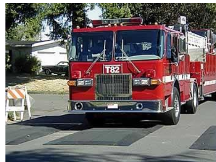
Figure 2 - Speed Cushions, Calgary, AB 9