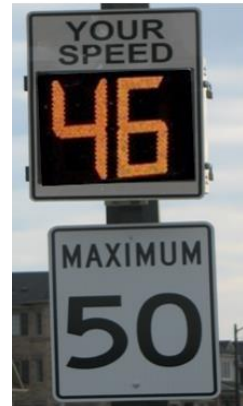
Figure 17 - Whaley Way, Milton, ON

Driver Feedback Boards are pole-mounted devices equipped with radar speed detectors and an LED display. The boards are capable of detecting the speed of an approaching vehicle and displaying it back to the driver. When combined with a regulatory speed limit sign, a clear message is sent to the driver displaying their vehicle speed. The objective of the program is to improve road safety by making drivers aware of their speed, evoking voluntary speed compliance.