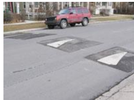
Figure 3 - Speed Cushions for Emergency Vehicles 10