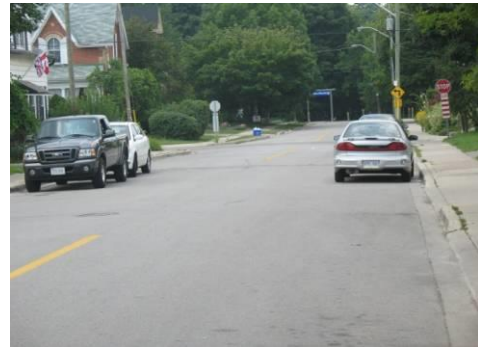
Figure 7 – On-street Parking on Both Sides, James St., Milton, ON

On-street parking is a practical way of decreasing the effective road width by allowing vehicles to park adjacent and parallel to the road edge. This type of measure is applicable on most local and collector roadways. The primary benefit of allowing on-street parking as a traffic calming measure is the reduction in vehicle speeds due to the narrowed travel space. This type of measure may prove to be effective for older residential neighbourhoods closer to the Town Centre. In newer Town subdivisions some roadways have a narrower design to accommodate parking on only one side (parking banned on opposite side). In this situation, changing the parking configuration to permit parking on both sides is not recommended.