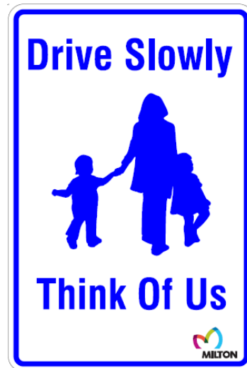
Figure 18 - Scott Blvd., Milton, ON