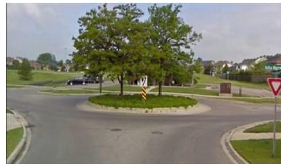
Figure 9 - Traffic Circle, Ancaster, ON

Traffic circles are a raised island located in the centre of an intersection designed to reduce vehicle speeds and reduce vehicle-vehicle conflicts. Intersection should have balanced traffic volumes. Traffic circles should not be used on major collector or arterial roadways, even where these roads intersect local residential streets. Experience in other communities has shown that, where traffic circles are located on more major roads that carry significantly higher traffic volume, traffic entering the traffic circle from the major road often fails to yield to traffic that has already entered from the local street, creating a safety concern. Traffic circles should not be confused with the modern roundabout which is typically larger with raised median islands at all approaches and it may serve two or more entry lanes of traffic.