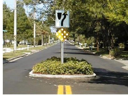
Figure 12 - Raised Median through Intersection, Kitchener, ON

Raised median through intersection. These devices may be used on the centerlines of local and collector roadways to prevent left-turn and through movements to and from intersecting streets. This type of device is especially effective at preventing short-cutting and through traffic while providing some secondary pedestrian safety benefits.