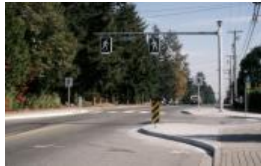
Figure 4 - Curb Extension

Curb extensions (intersection and/or mid-block) improve pedestrian safety by reducing the distance that pedestrians must travel to cross a roadway, by improving the visibility of pedestrians for approaching motorists, and the visibility of approaching vehicles for pedestrians. Curb extensions are sometimes referred to as bulb-outs or neck-downs. They can be used at intersections and at midblock locations, and can be used alone or in combination with a textured crosswalk and/or a median island. In addition to their pedestrian safety benefits, curb extensions on one or both sides of the roadway also help to reduce vehicle speeds. Curb extensions may be considered for use on both local and collector roadways, including transit and emergency response routes.