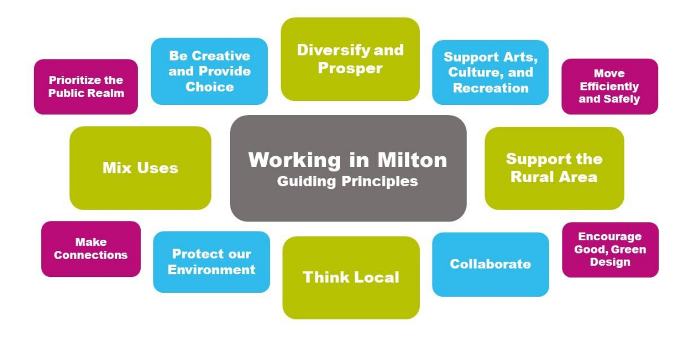
Figure 2 Working in Milton' Guiding Principles Hierachy

Twelve guiding principles were established for the New Official Plan at the visioning stage. The Guiding Principles provide direction to and evaluate the policy considerations as they are developed to answer the Big Questions. The Guiding Principles cover all four theme areas, Living, Moving, Working and Growing. However, some themes will cover specific Guiding Principles more than others.