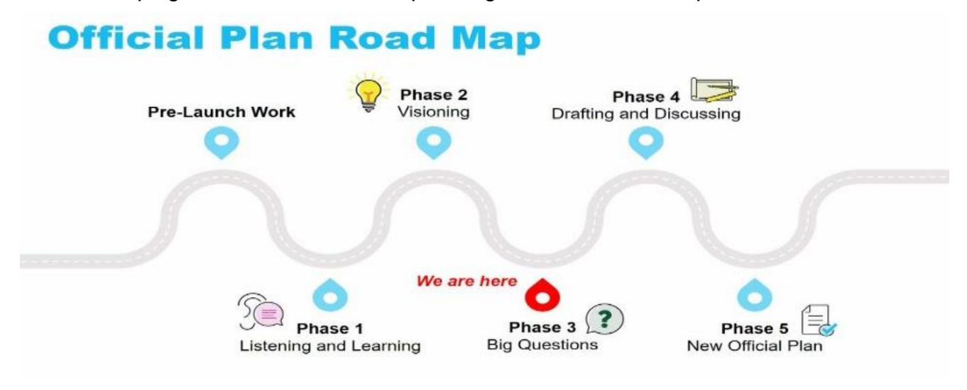
Figure 1 New Official Plan Road Map

The Background and Information Report for Working in Milton complements this document and explores the current context for Working in and around Milton. The Report explored thoughts and ideas we heard in our previous We Make Milton consultation and engagement with the public. Six Big Questions have been identified on how the Town's New Official Plan can protect and support working in Milton in keeping with our new land use planning vision, 'Choice Shapes Us.'