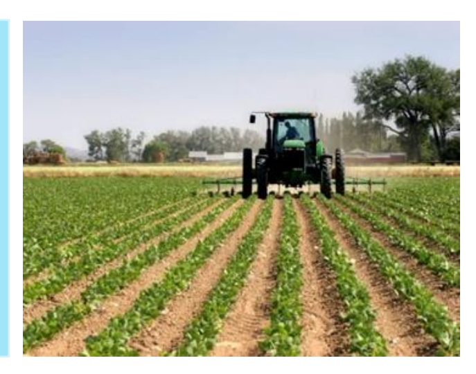
Stage 4: New Official Plan Drafting

Uses that are secondary to the principal agricultural use of the property, and are limited in area. On-farm diversified uses include, but are not limited to, home occupations, home industries, agritourism uses, and uses that produce value- added agricultural products. Land-extensive energy facilities, such as ground-mounted solar battery storage are permitted in prime agricultural areas, including specialty crop areas, only as on-farm diversified uses.