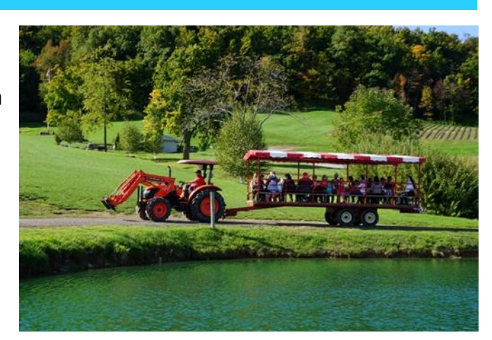
Figure 5 Agr-Tourism in Milton

The new Official Plan policies must identify and protect adequate mineral aggregate reserves for long-term use, while minimizing any adverse environmental impacts.