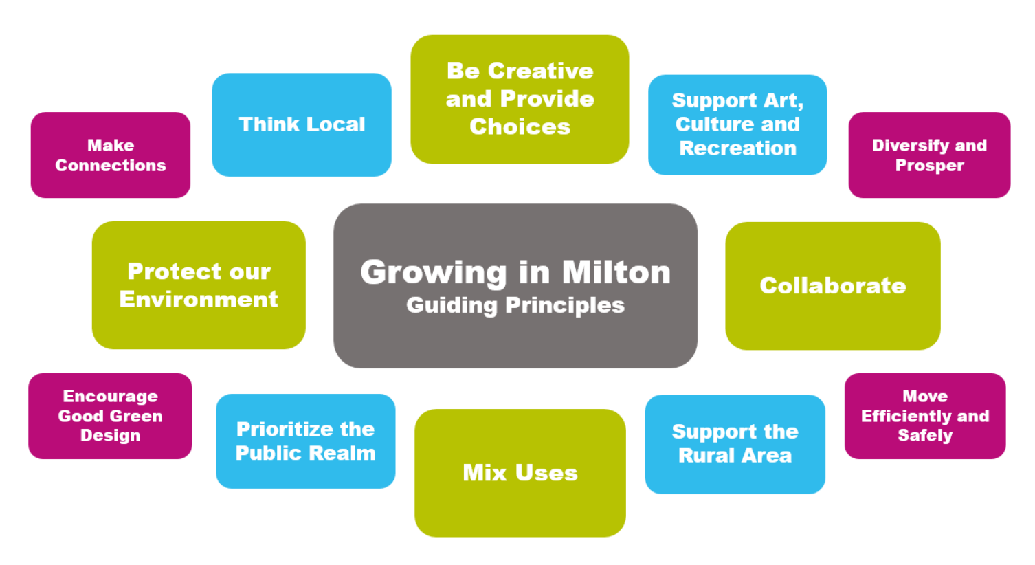
Figure 3. Growing in Milton's Guiding Principles Hierarchy.

The Big Questions and Policy Considerations for the Growing in Milton theme are strongly tied to the Guiding Principles of: Be Creative and Provide Choice; Collaborate; Mix of Uses; and Prioritize the Public Realm. Other Guiding Principles are still relevant to the Growing in Milton Policy Considerations. They are also further discussed and supported through the exploration of the living, moving and working themes.