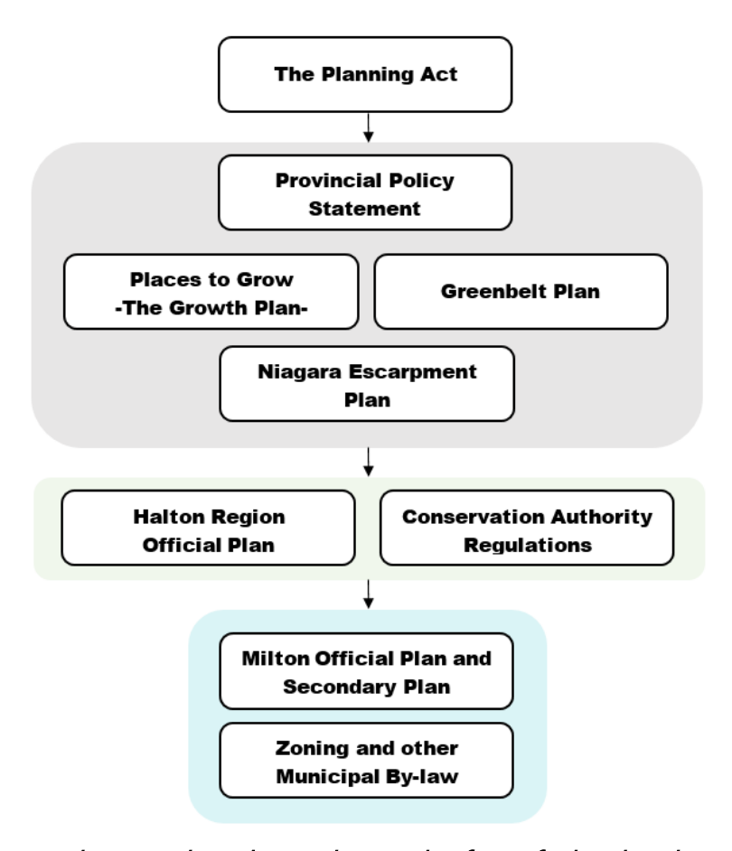
Figure 4. Planning legislation hierarchy from federal to local level.

The documents highlighted in Table 2 below are statutory documents that that must be adhered to and considered when drafting policy considerations – and, eventually, new Official Plan policies – related to the Growing in Milton theme. These documents can be at a federal, provincial or regional level. Figure 4 displays the current hierarchy of planning policy in Ontario.