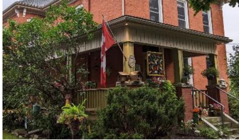
Wrapped Around Porch 2023