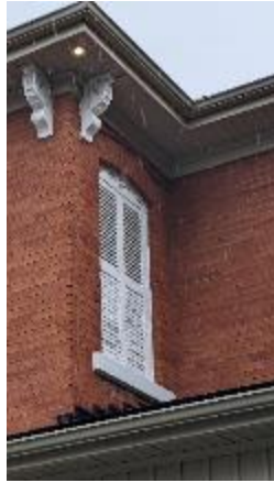
Roof Brackets locations