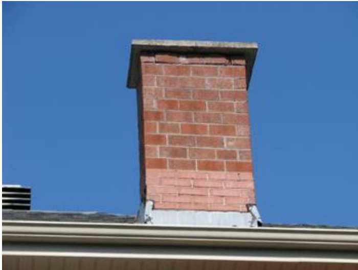
East Elevation along Martin Street

Medium hip roof, two stone chimneys, projecting eaves and decorative frieze