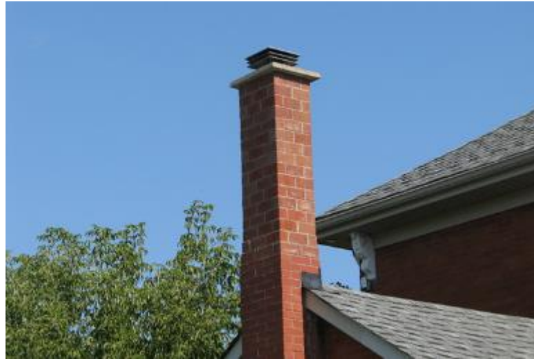
Second Chimney seen from the rear elevation