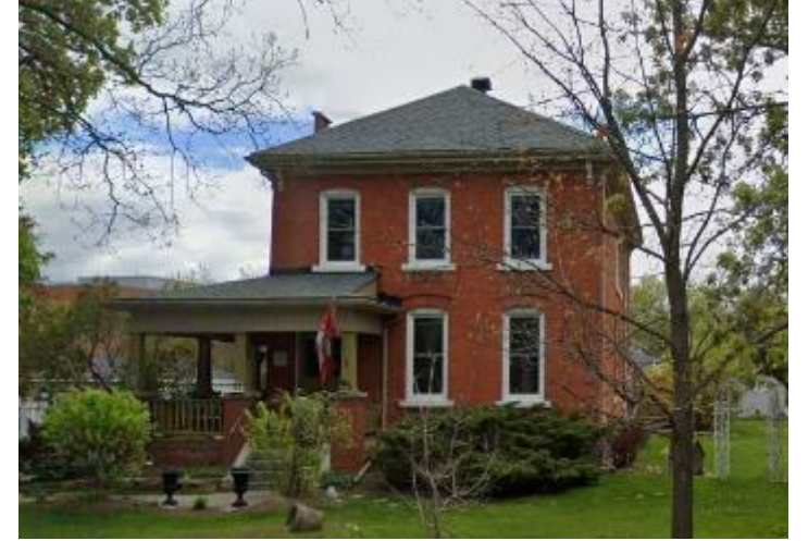
East Elevation along Martin Street, 2023