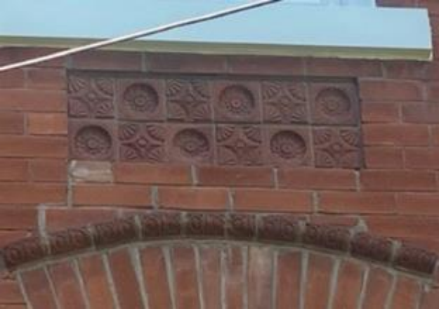
Upper Floor decorative brick tiles below lug sills