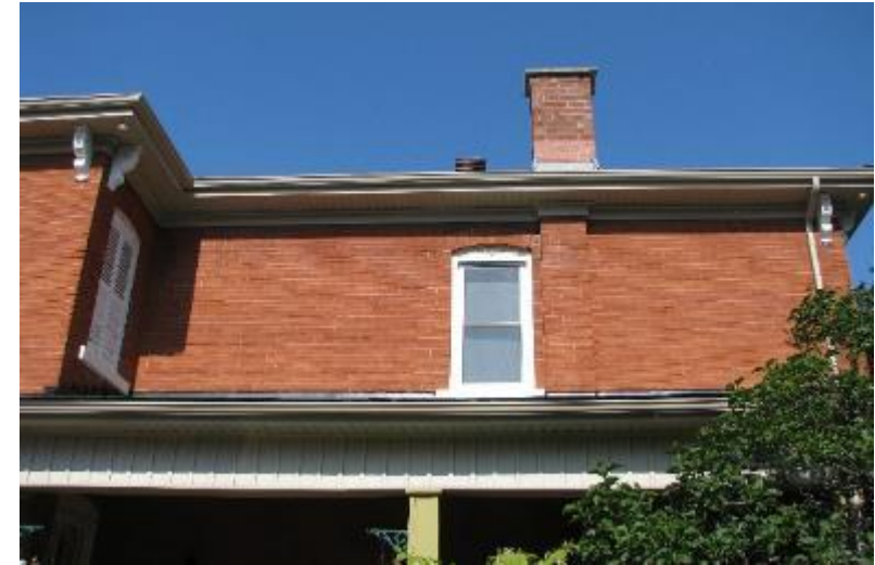
Chimneys seen from the south elevation