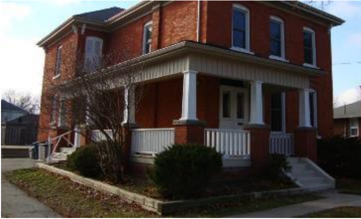
Wrapped Around Porch 2019

Open wrapped around verandah with trimmed tapered post on brick pedestals, upper trim open railings and straight steps