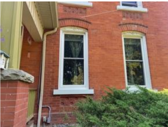
Double Sash Windows on ground Floor