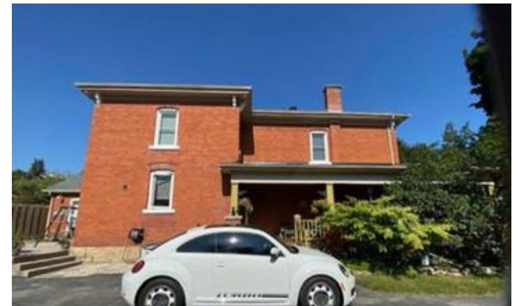
South (Side Elevation), 2023