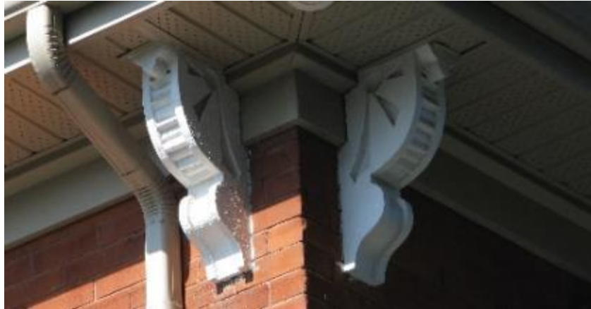
Corners at corner