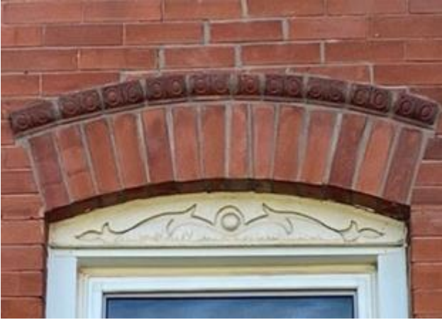
Carve relief on Window transom

Single and double sash windows with segmented arch brick voussoirs and decorative extrados