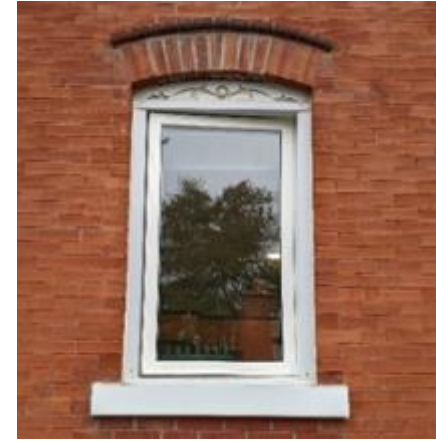
Single Sash Window