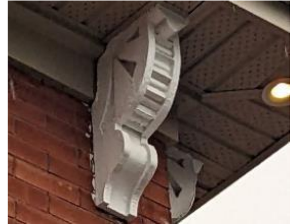
Roof Brackets details