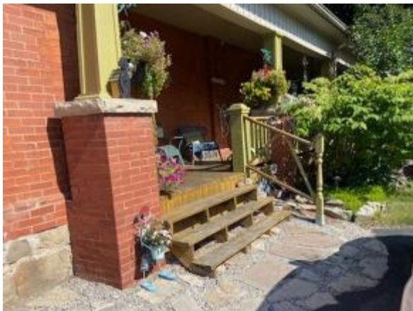
Second entrance to porch at south elevation