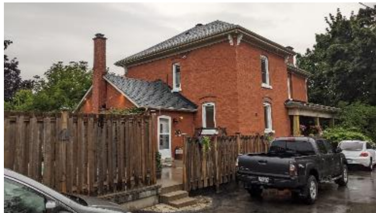
East Elevation along Martin Street