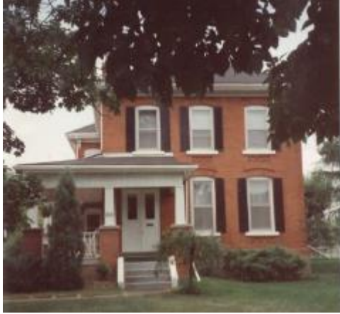
East Elevation along Martin Street, 1991

A two storey brick Victorian/Edwardian Style house with brick chimney.