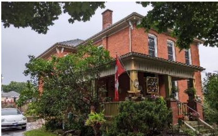
East Elevation along Martin Street