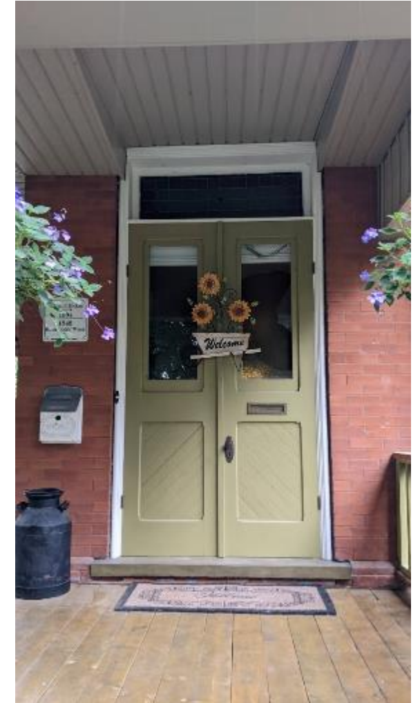
Two Leaf, four panels door with rectangular transform and upper glazed insert