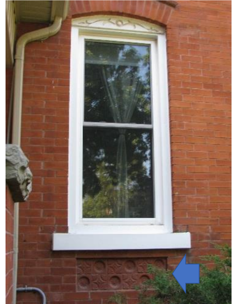
Location of Brick tiles along Front Elevation