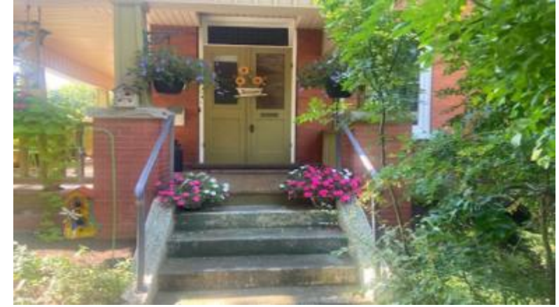
Wrapped Around Porch entrance at front elevation