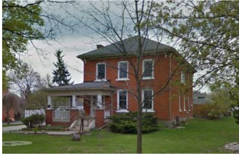
East Elevation along Martin Street, 2016