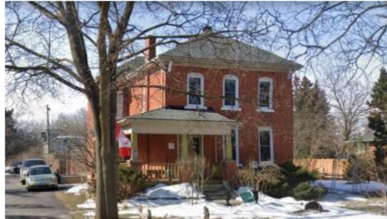
East Elevation along Martin Street, 2022