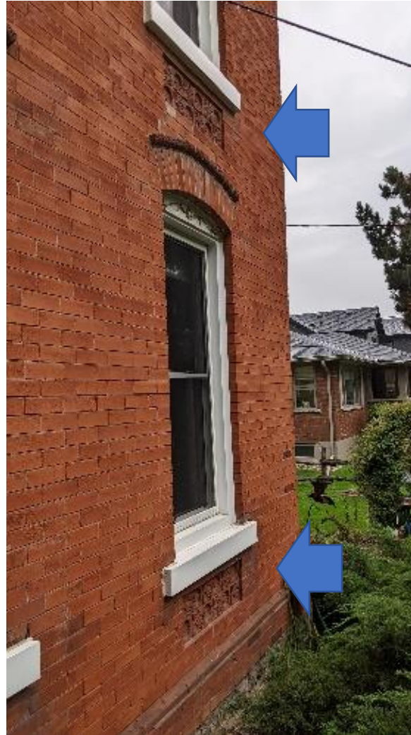
Location of decorative brick tiles