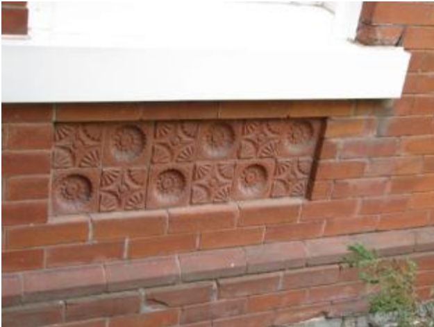
Lower Floor decorative brick tiles below lug sills