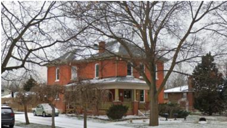
East Elevation along Martin Street, 2022