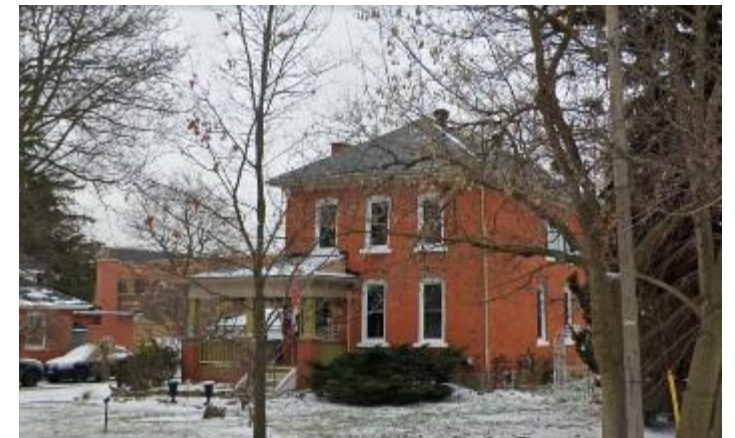
Chimney seen from Martin Street