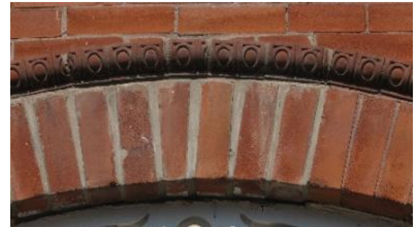
Decorative Brick Voussoirs and Extrados