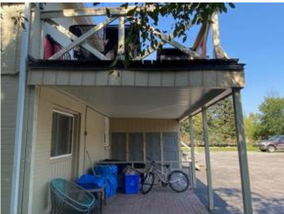
East Elevation at Deck