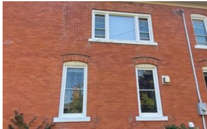
Windows on South Elevation