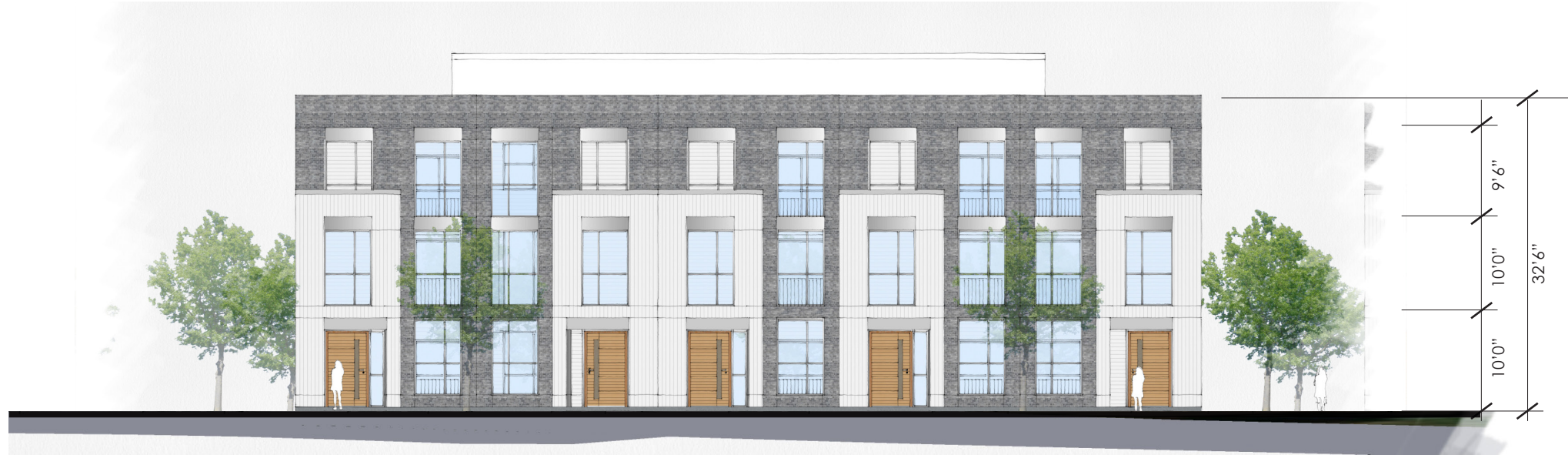
PROPOSED TYP NORH ELEVATION