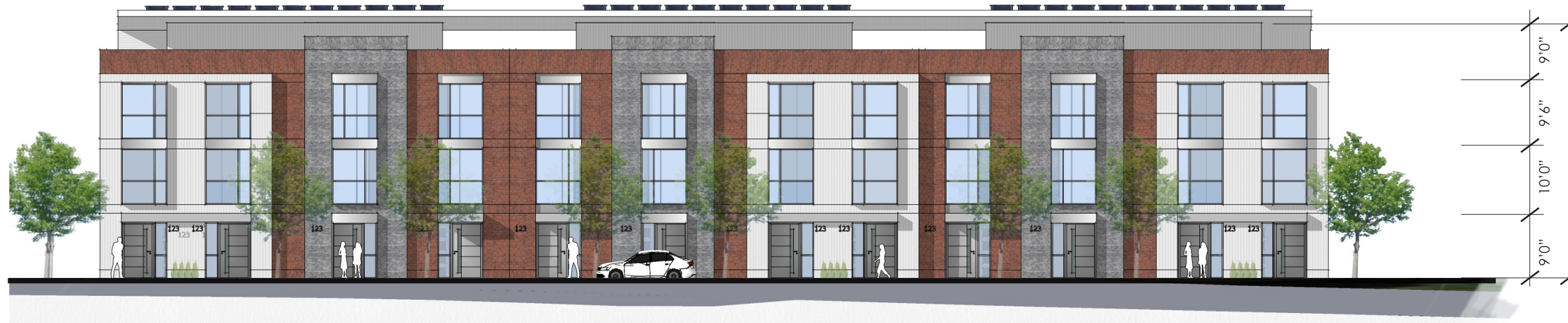
PROPOSED TYP EAST ELEVATION