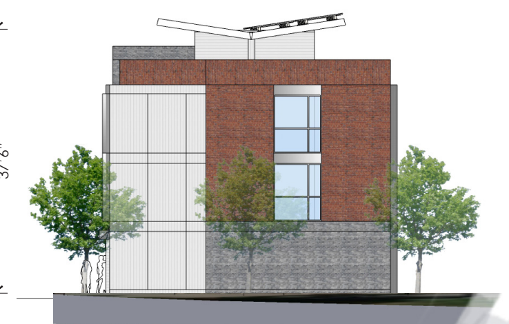
PROPOSED TYP SOUTH ELEVATION