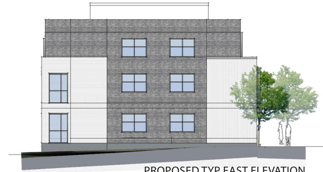
PROPOSED TYP EAST ELEVATION