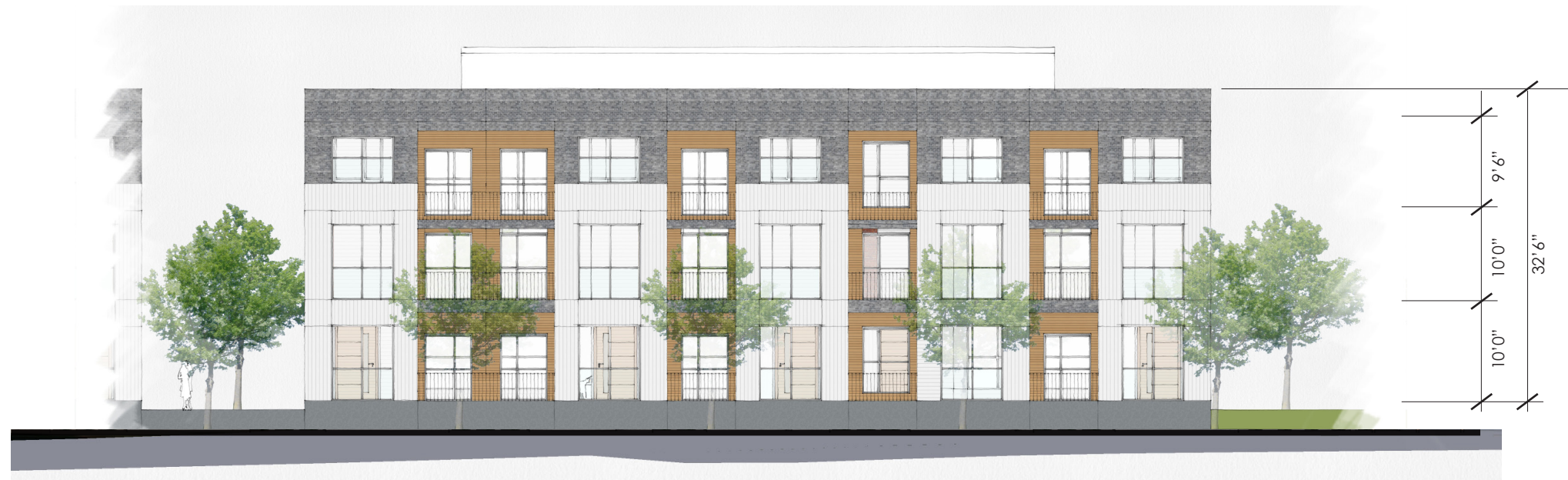
PROPOSED TYP SOUTH ELEVATION