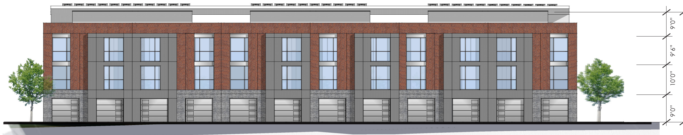
PROPOSED TYP WEST ELEVATION