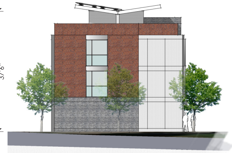
PROPOSED TYP NORTH ELEVATION