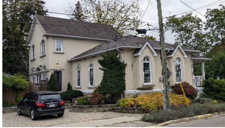
Rear Elevation along Martin Street