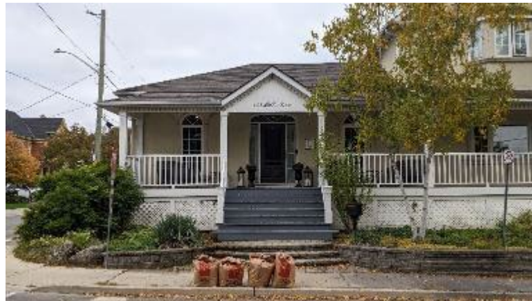
View of the Historical portion of the house