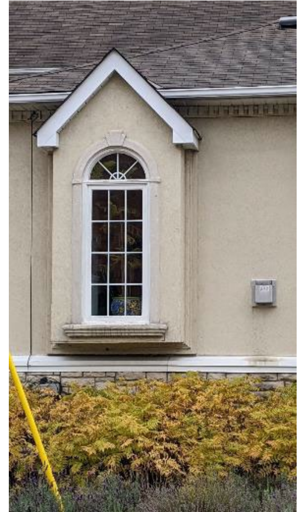
Existing Window West Elevation