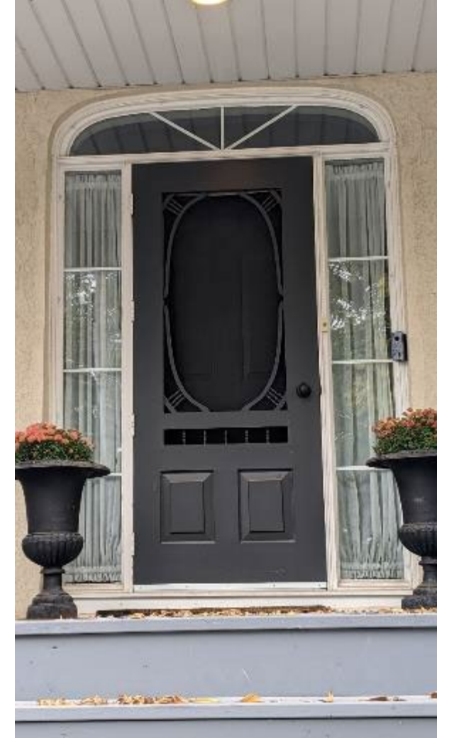
Existing Front Door, single leaf with four panel side lights and elliptical transom