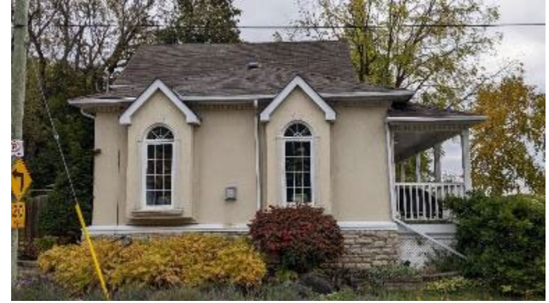
West Elevation along Mill Street