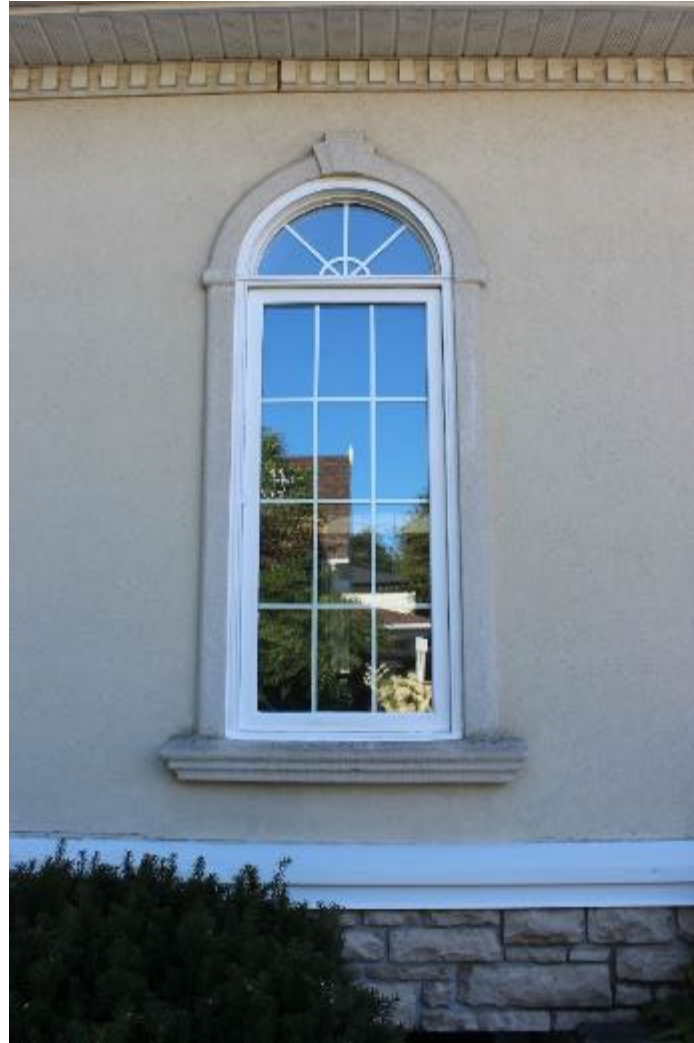
Existing Window North Elevation