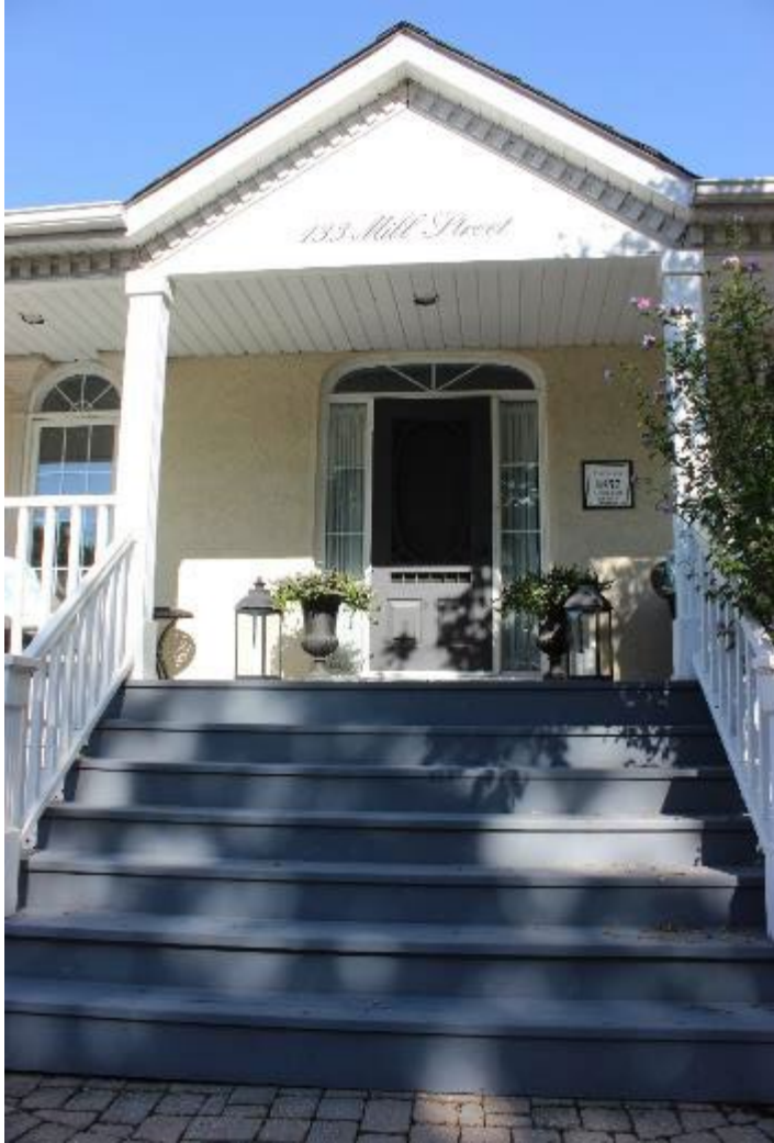
Central Raised Porch Entrance