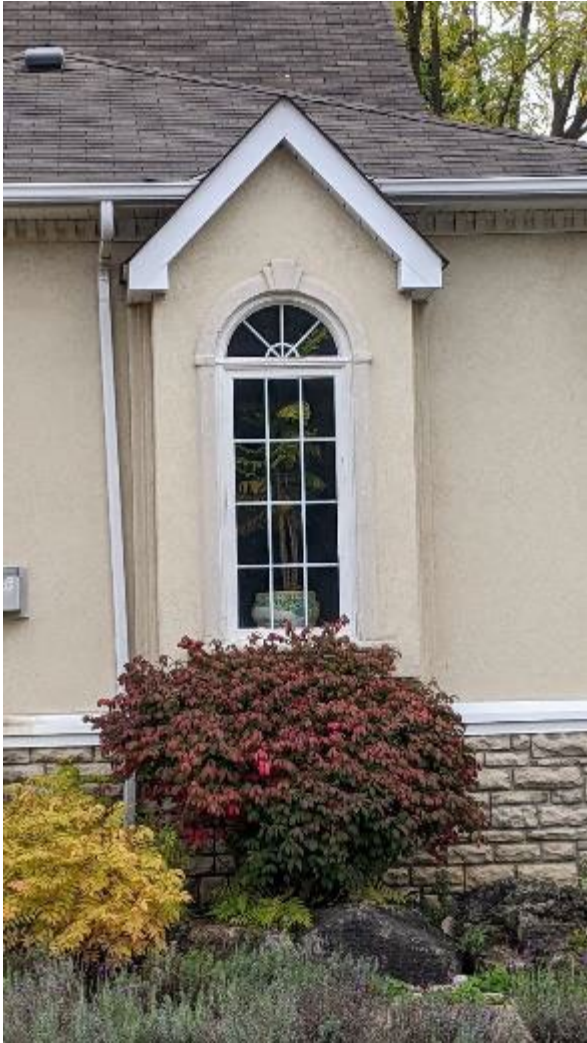
Existing Window West Elevation