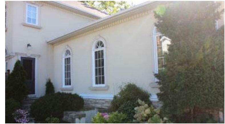
Rear Historical Elevation