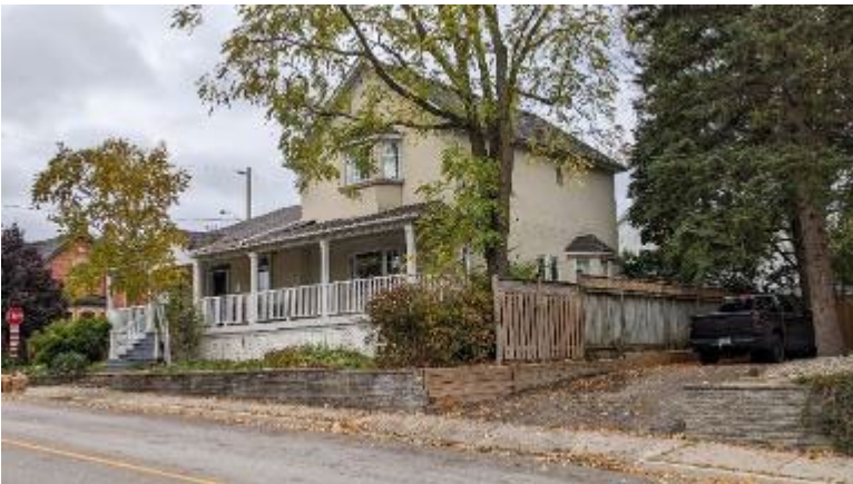
Elevation along Mill Street