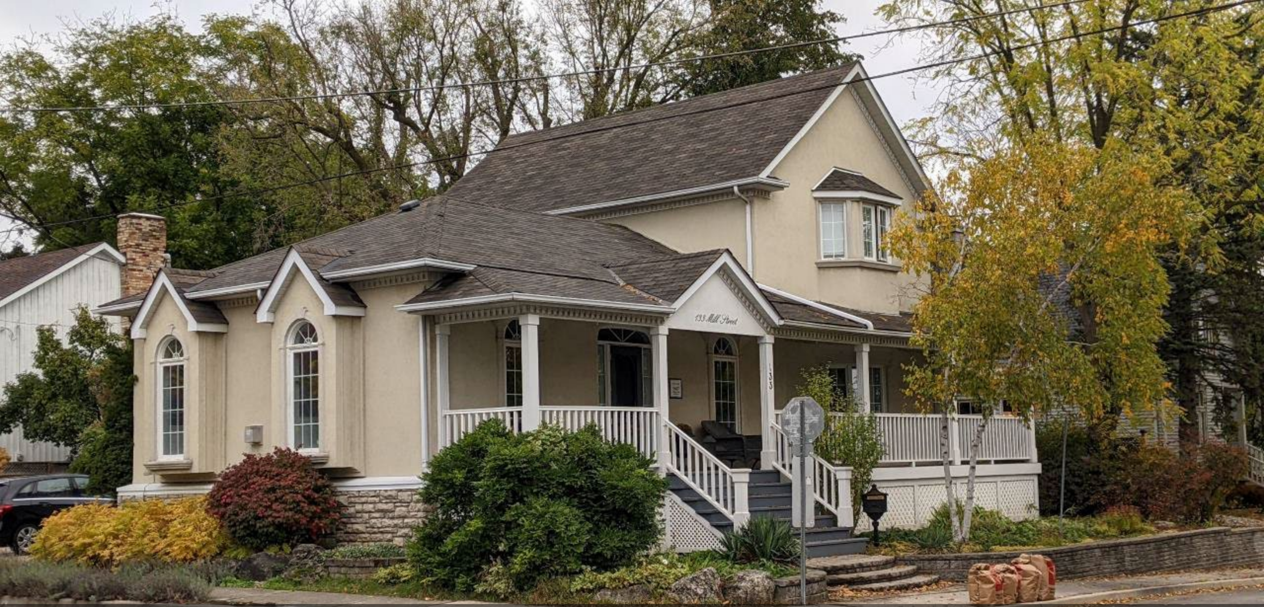
Appendix 3 Photographic Record _ Heritage Attributes _ 133 Mill Street