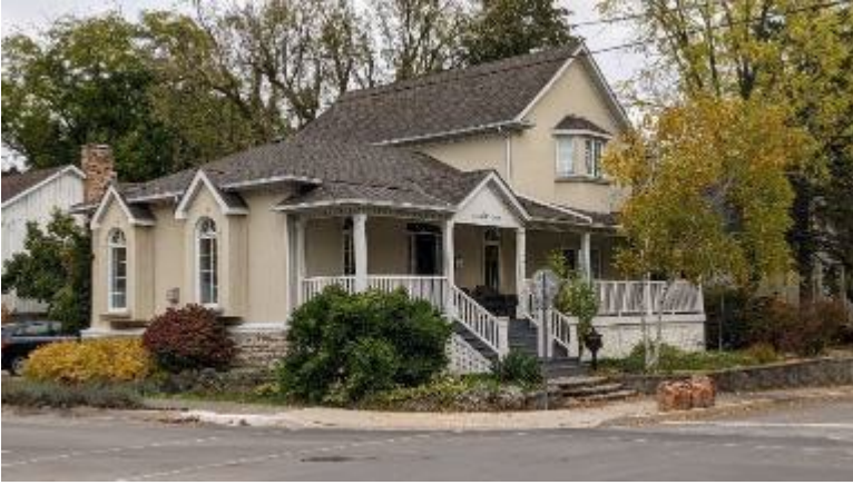
Corner View from Mill and Martin street