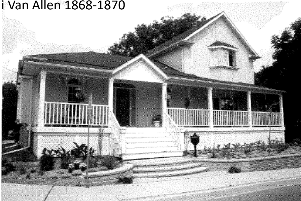
An original Regency cottage on a high base has disappeared in recent major additions. The original section of the building was to the left of the photo.