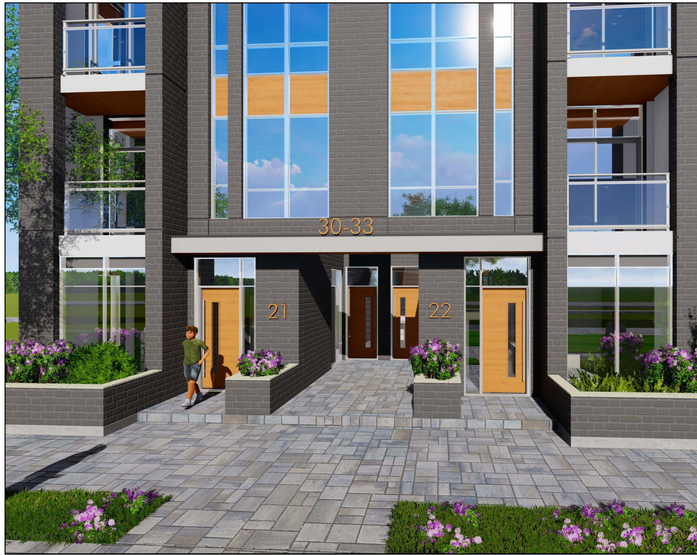
ENLARGED FRONT PERSPECTIVE AT DERRY ROAD 1 NTS dA6.2