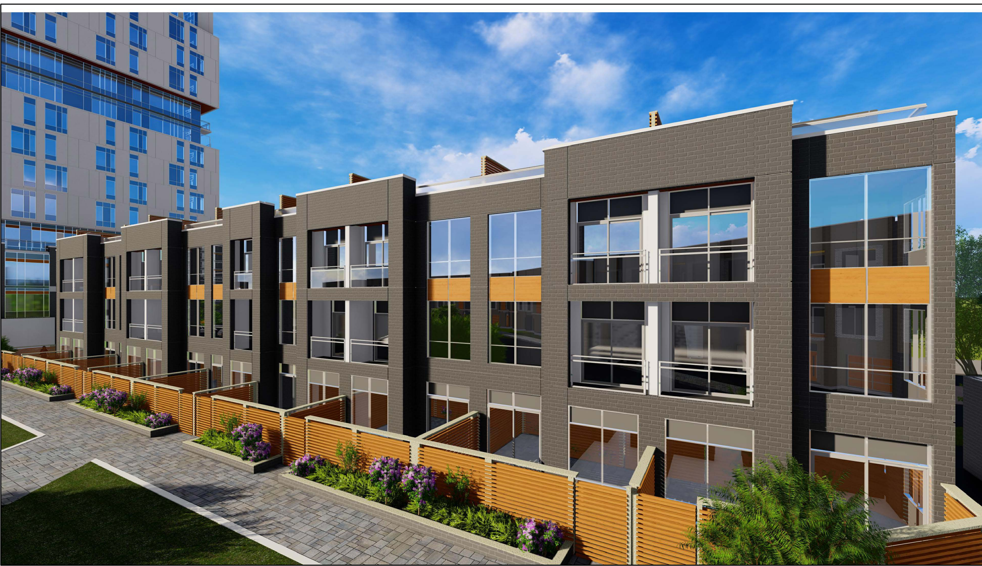
REAR PERSPECTIVE AT INTERIOR COURTYARD 4 NTS dA6.2

Contractor Must Check And Verify All Dimensions On The Job. Do Not Scale The Drawings. All Drawings, Specifications And Related Documents Are The Copyright Of The Architect And Must Be Returned Upon Request. Reproduction Of Drawings, Specifications And Related Documents In Part Or Whole Is Forbidden Without The Architects Written Permission. This Drawing Is Not To Be Used For Construction Until Signed By The Architect. Date: