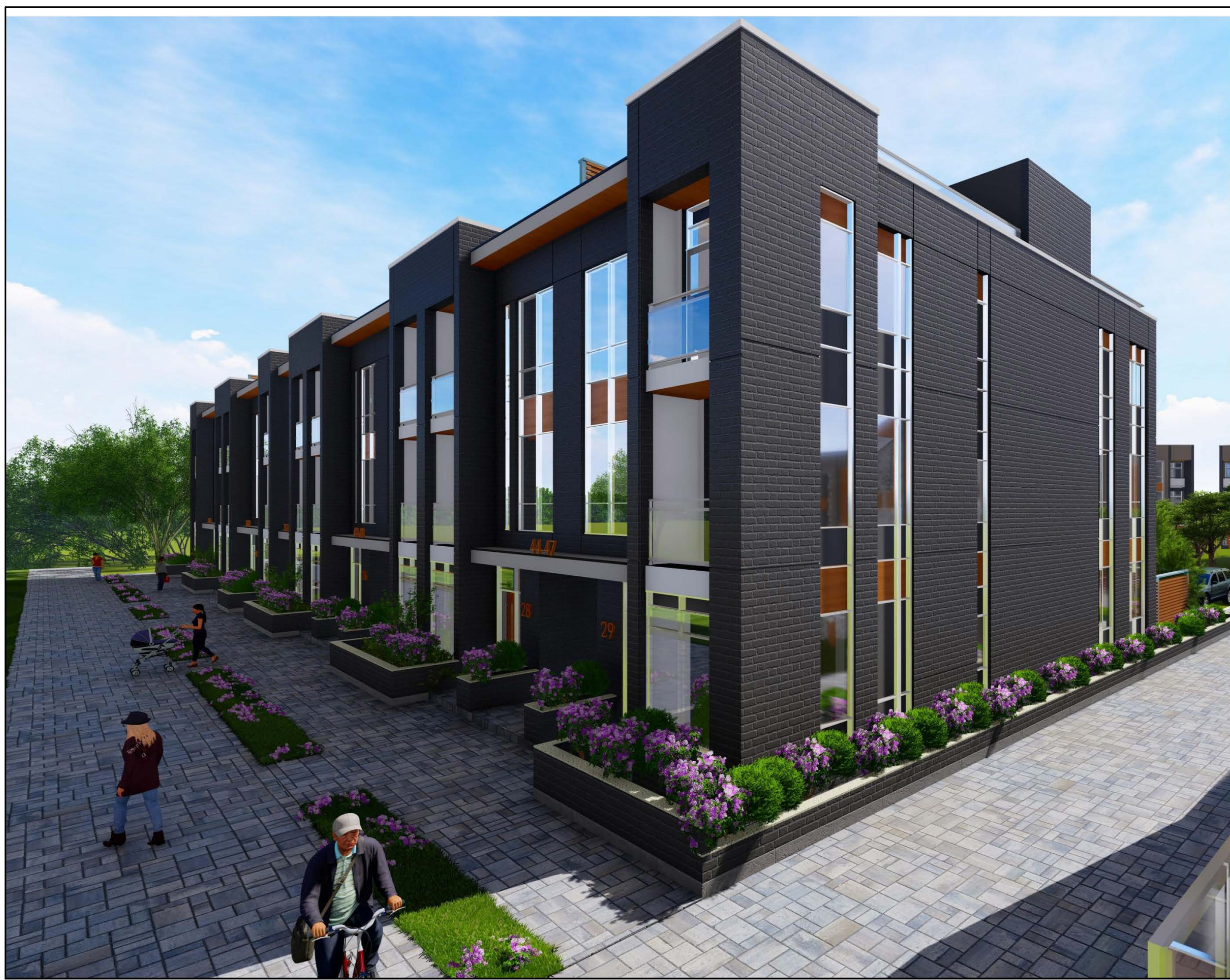
WEST SIDE CORNER VIEW 3 NTS dA6.2