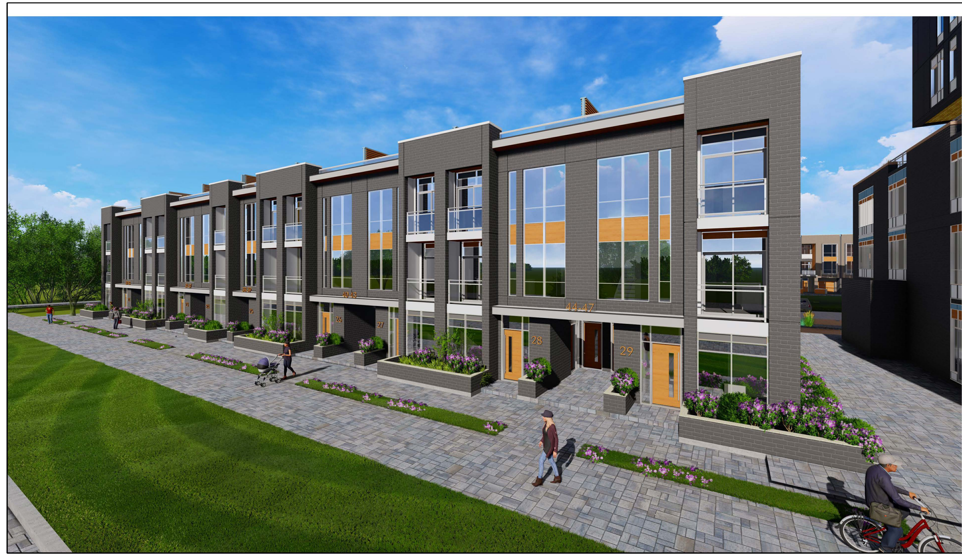
FRONT PERSPECTIVE AT DERRY ROAD 2 NTS dA6.2