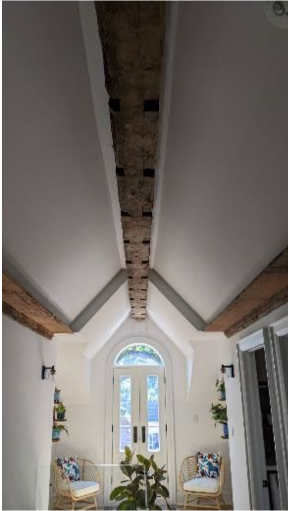
Hand hewn timber beam Second Floor