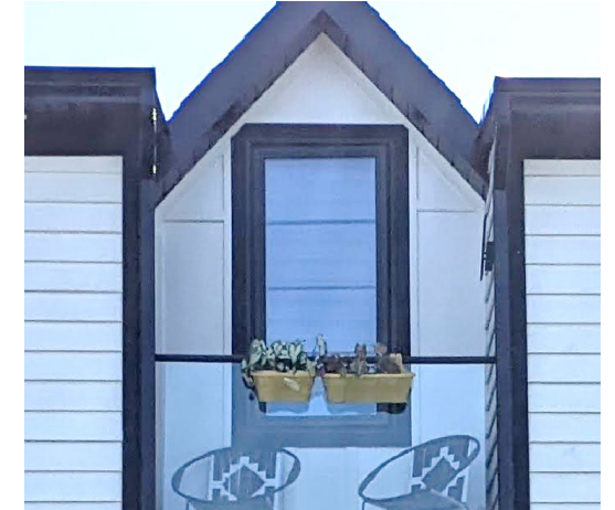
New Dormer Window