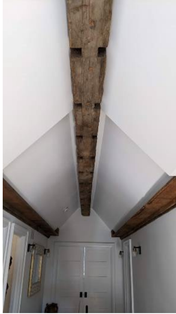
Hand hewn timber beam Second Floor