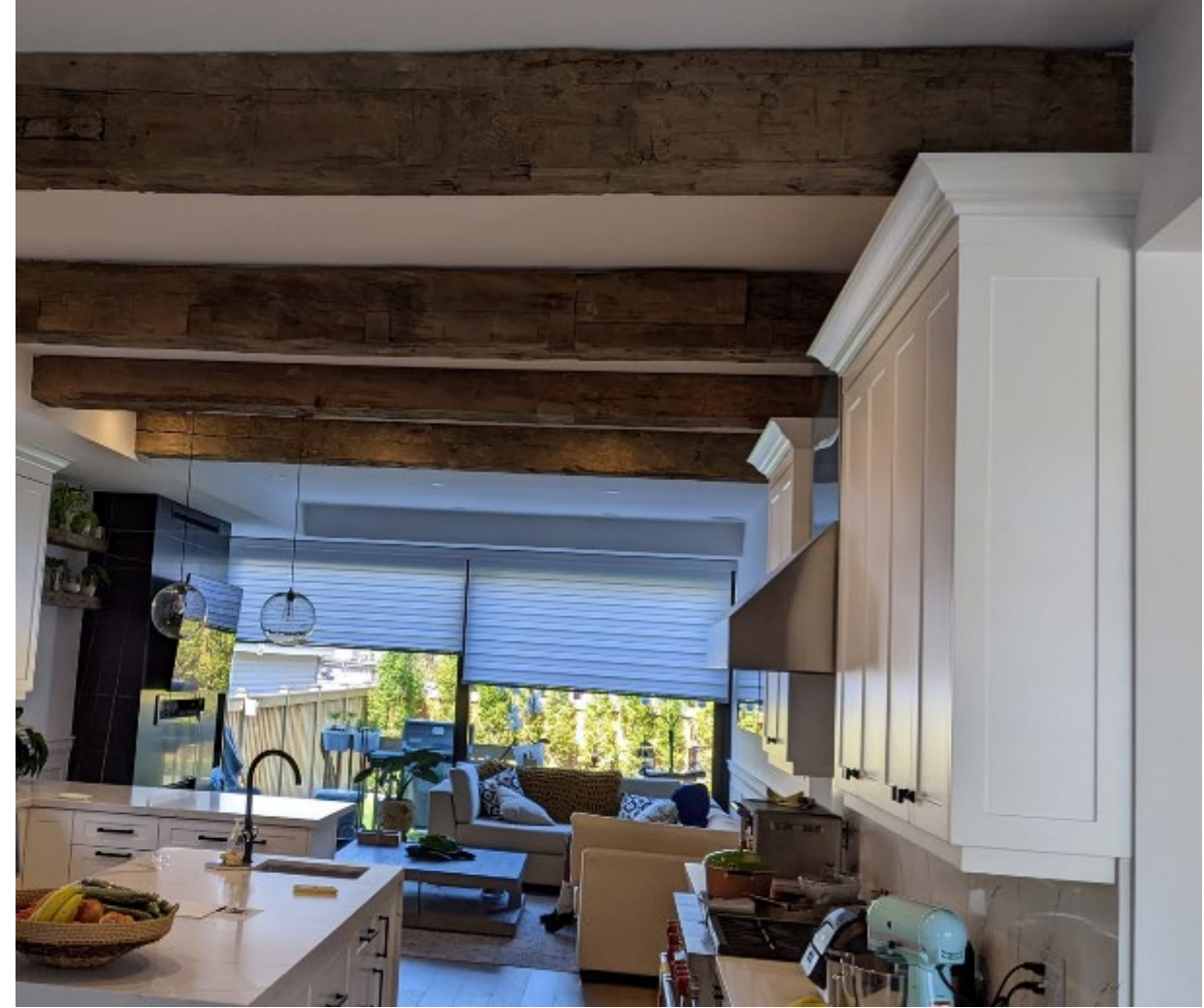
Hand hewn timber beam