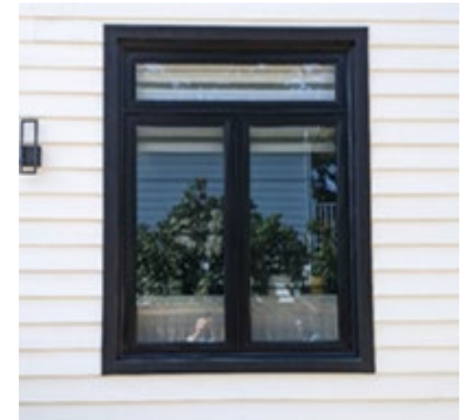
New ground floor window