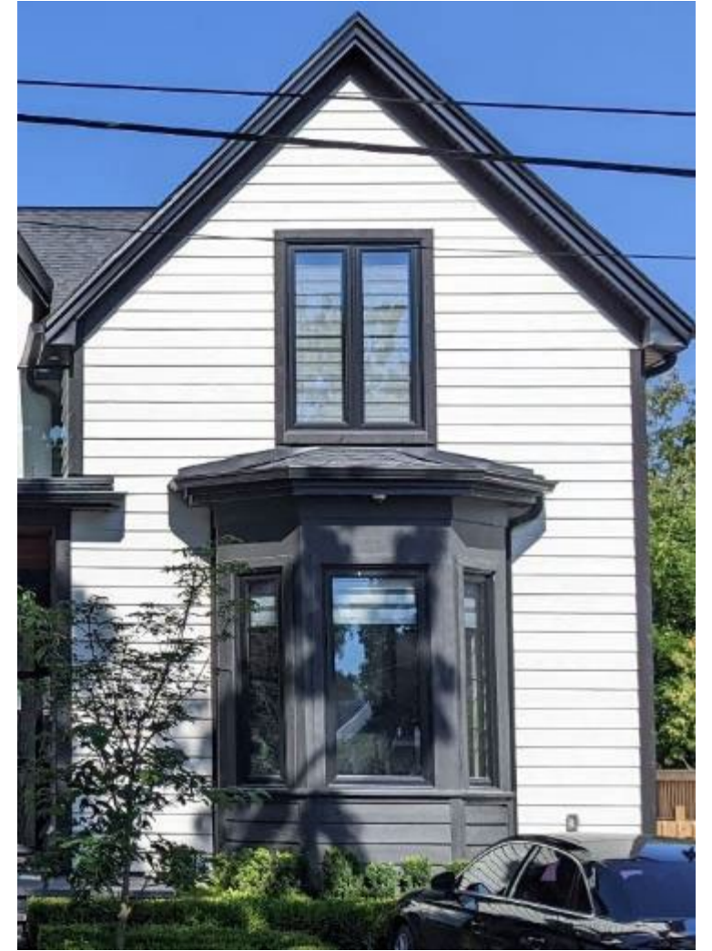
Right Bay Window