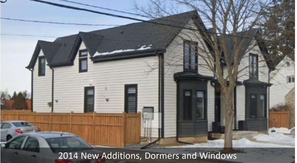
2014 New Additions, Dormers and Windows