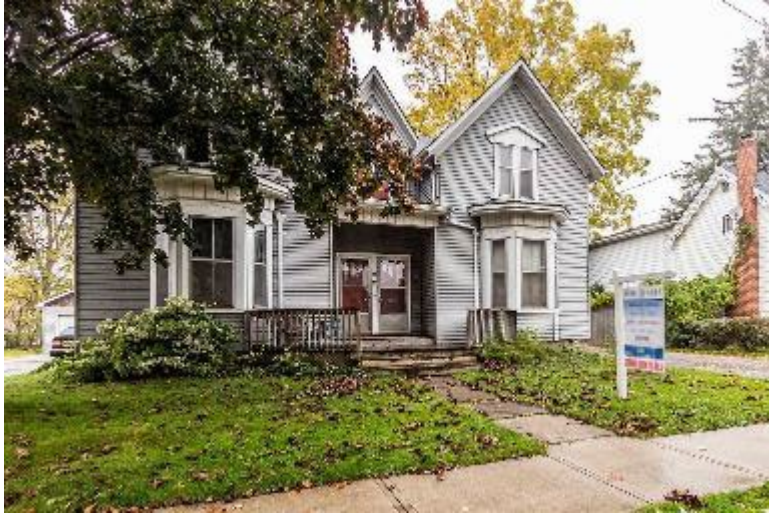
Queen Street Elevation