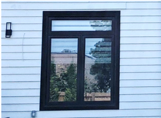
New ground floor window