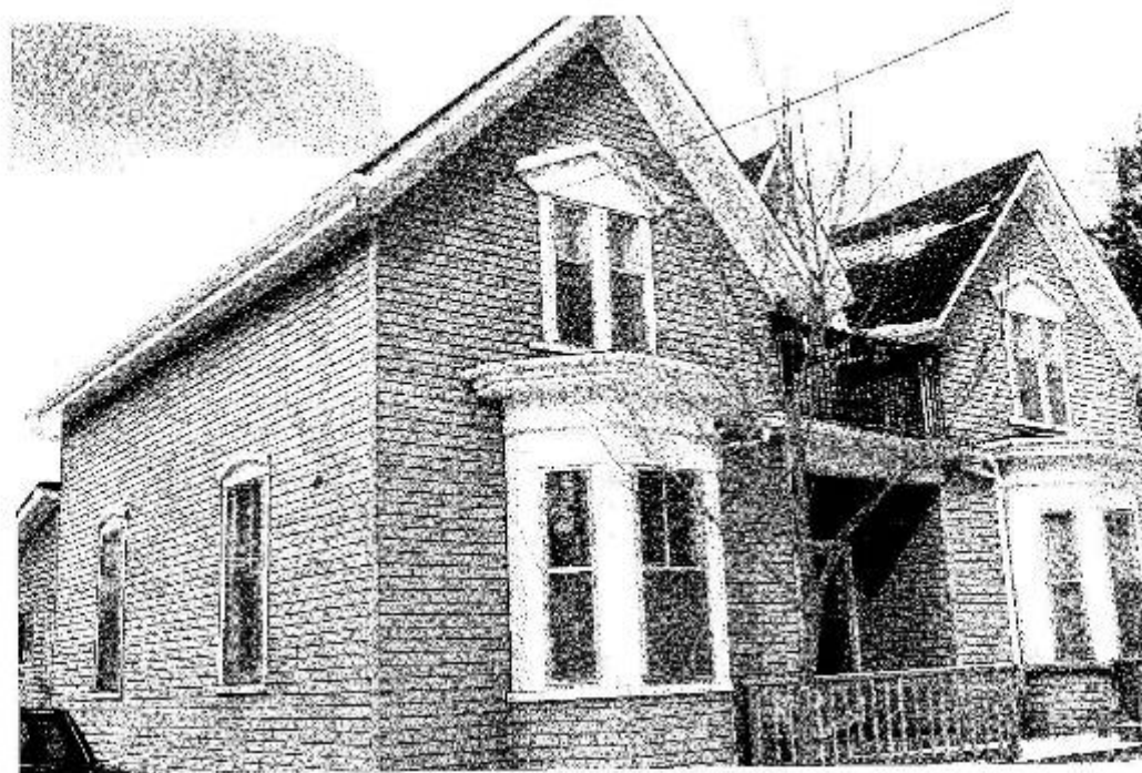
Built in the Victorian Gothic style this home has twin gables facing the street with one-storey bay windows and double unit, pediment topped windows above. The recessed entrance has a gable above.