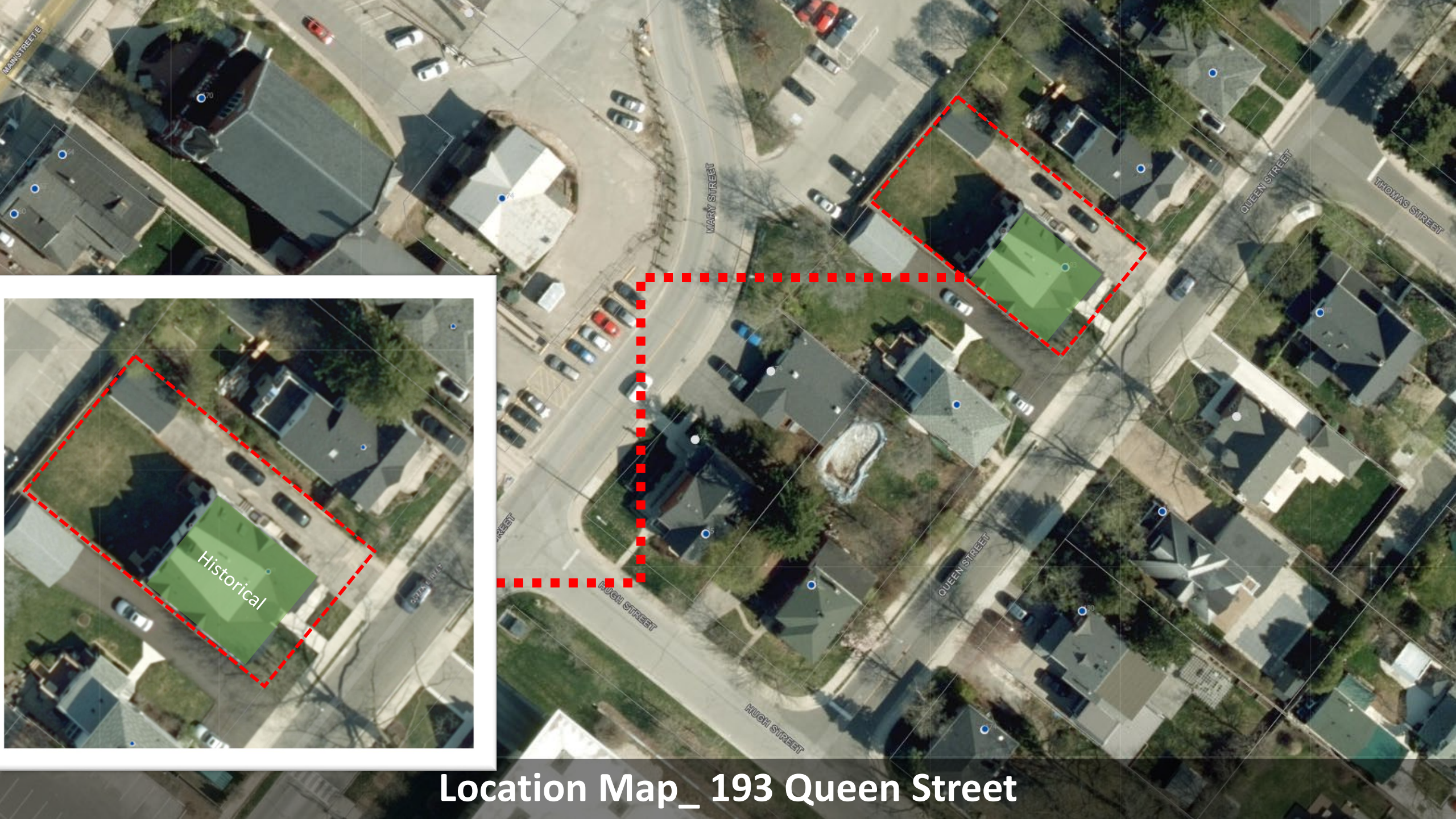
Location Map_ 193 Queen Street