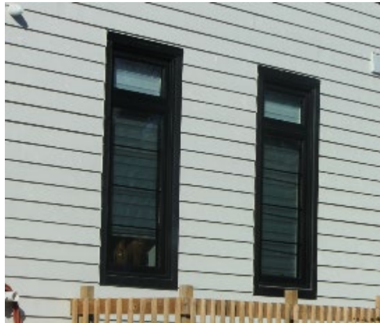
new ground floor window