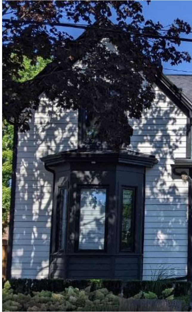
Left Bay Window

One-storey bay windows and double unit windows above (pediments were not replicated)