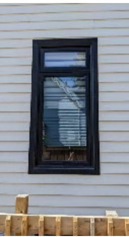
New ground floor window