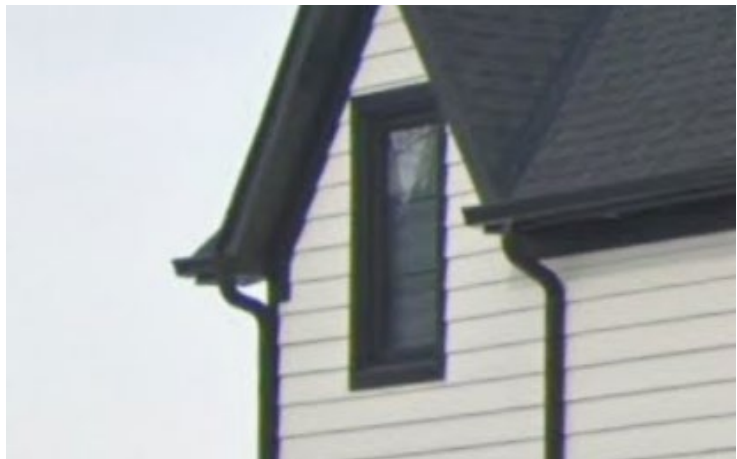
Second floor window (New Additions)