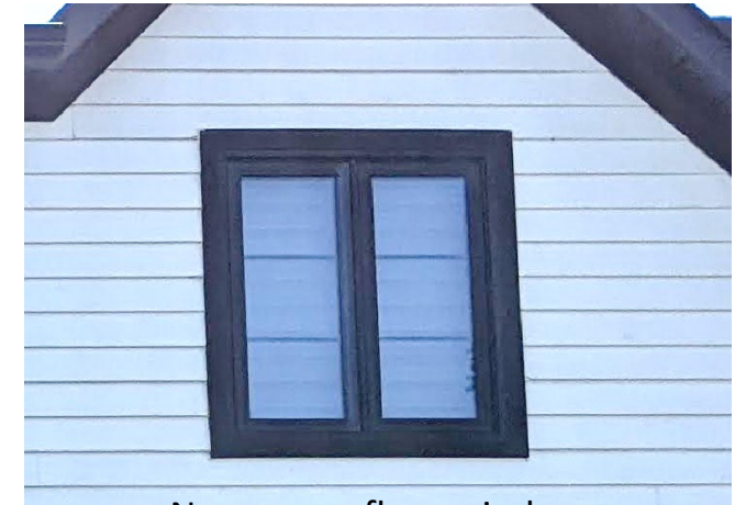
New upper floor window