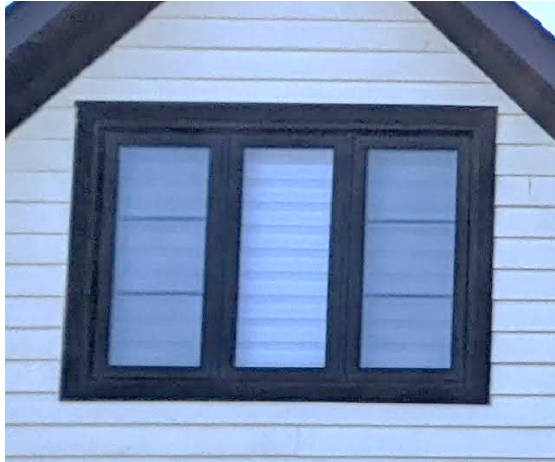
New upper floor window