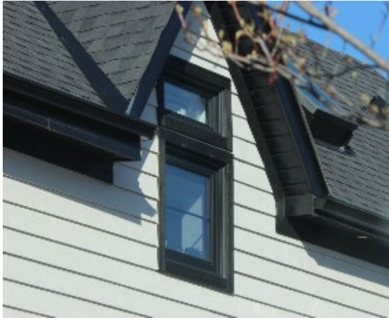
New Dormer window