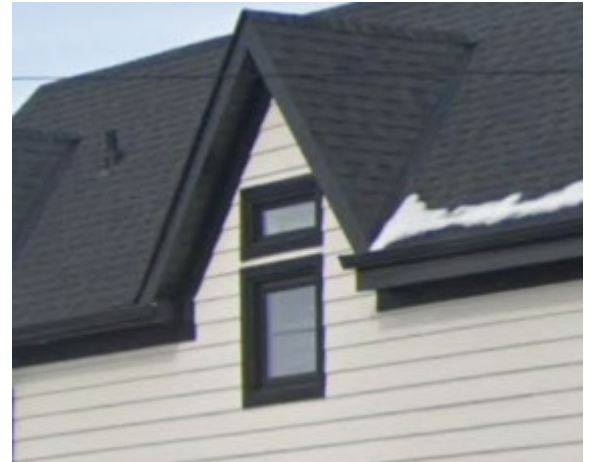
New dormer window