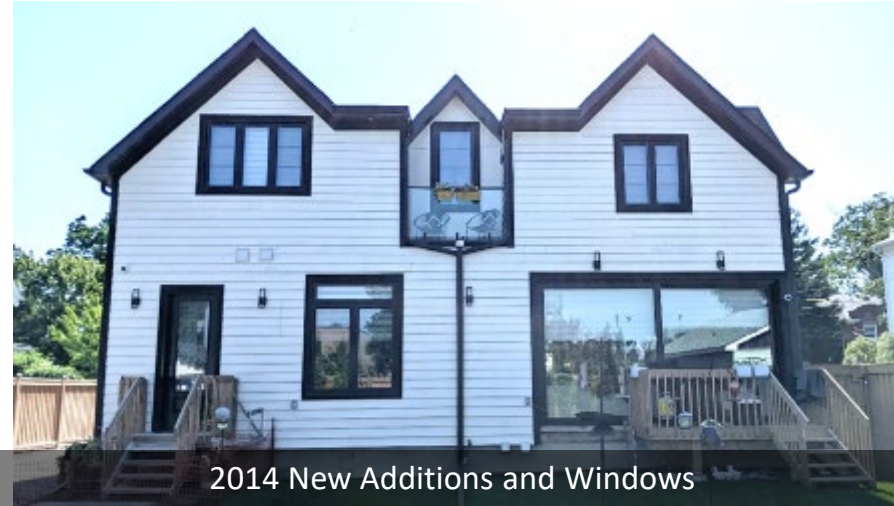
2014 New Additions and Windows