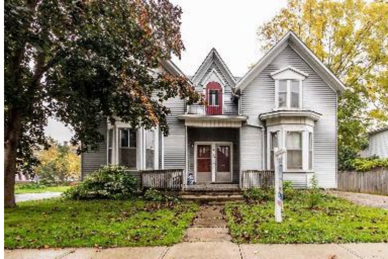
Queen Street Elevation