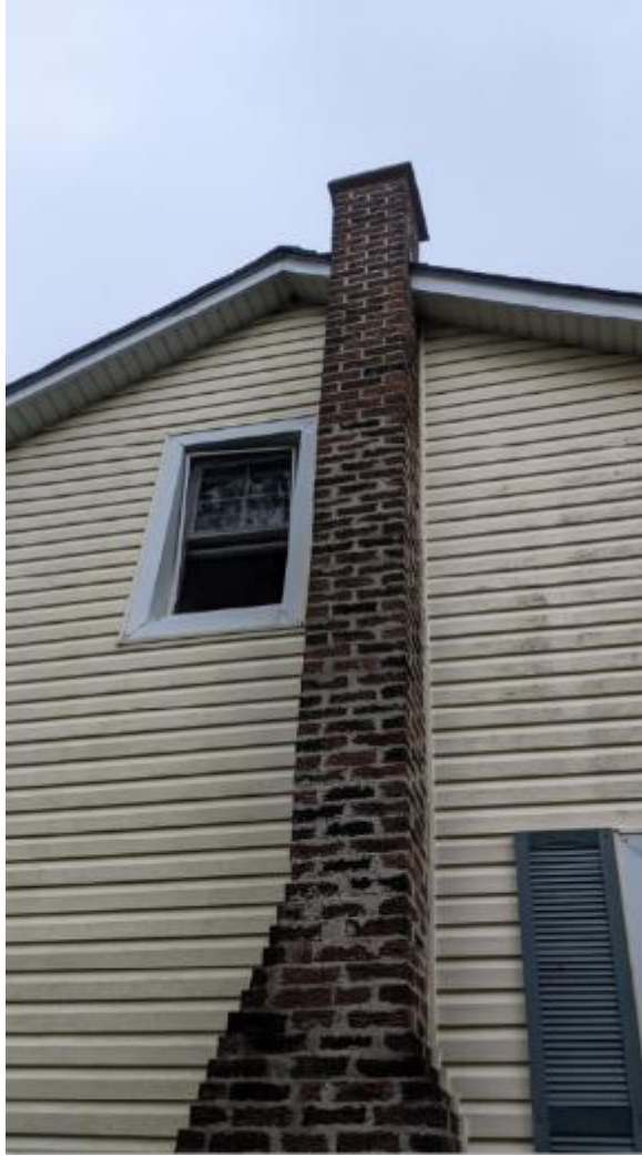
Brick Chimney Stack