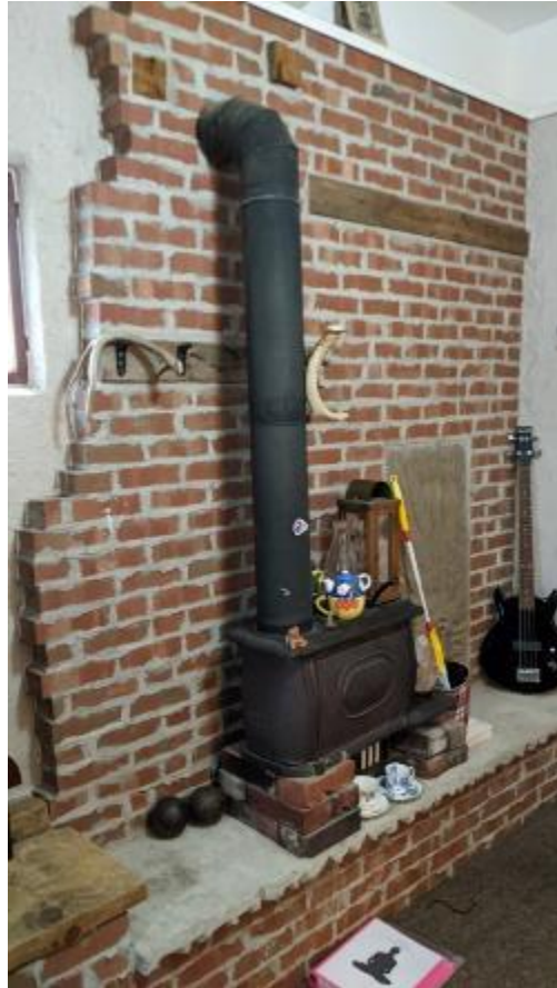
Wood Burning Furnace