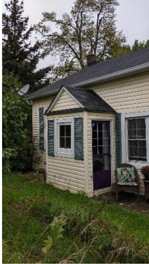
Enclosed Front Porch