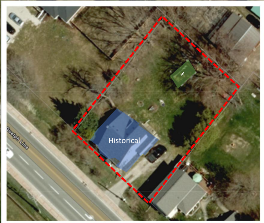
Location Map_ 11017 Guelph Line, Nassagaweya