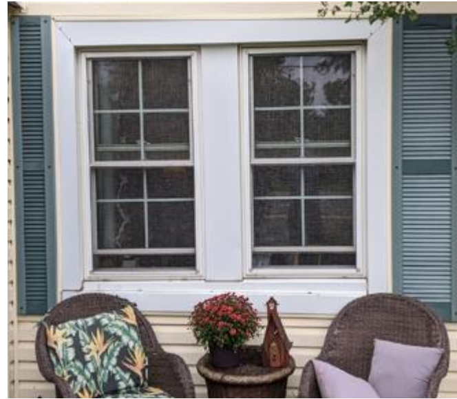
Pair of four over four windows