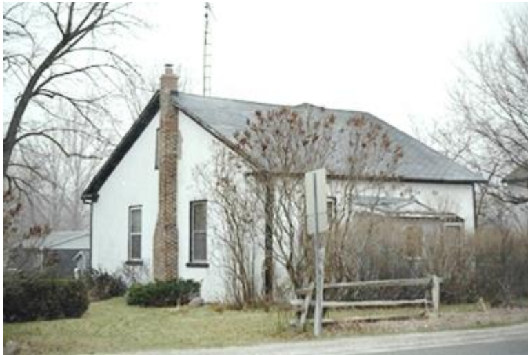
North-West Elevation 1960 (Stucco exterior)