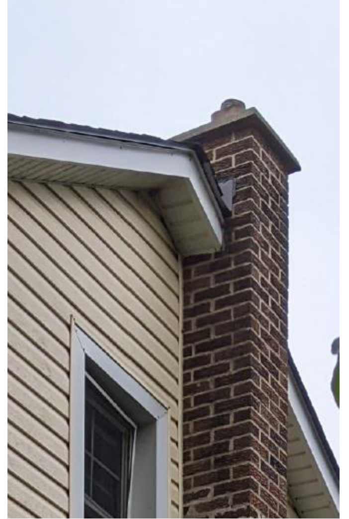
Rear Elevation Window