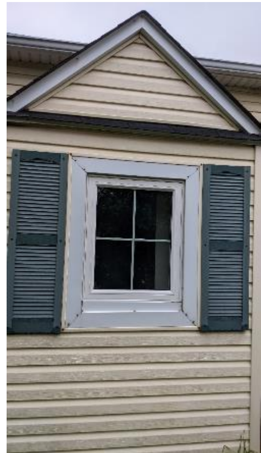
Front Porch Window