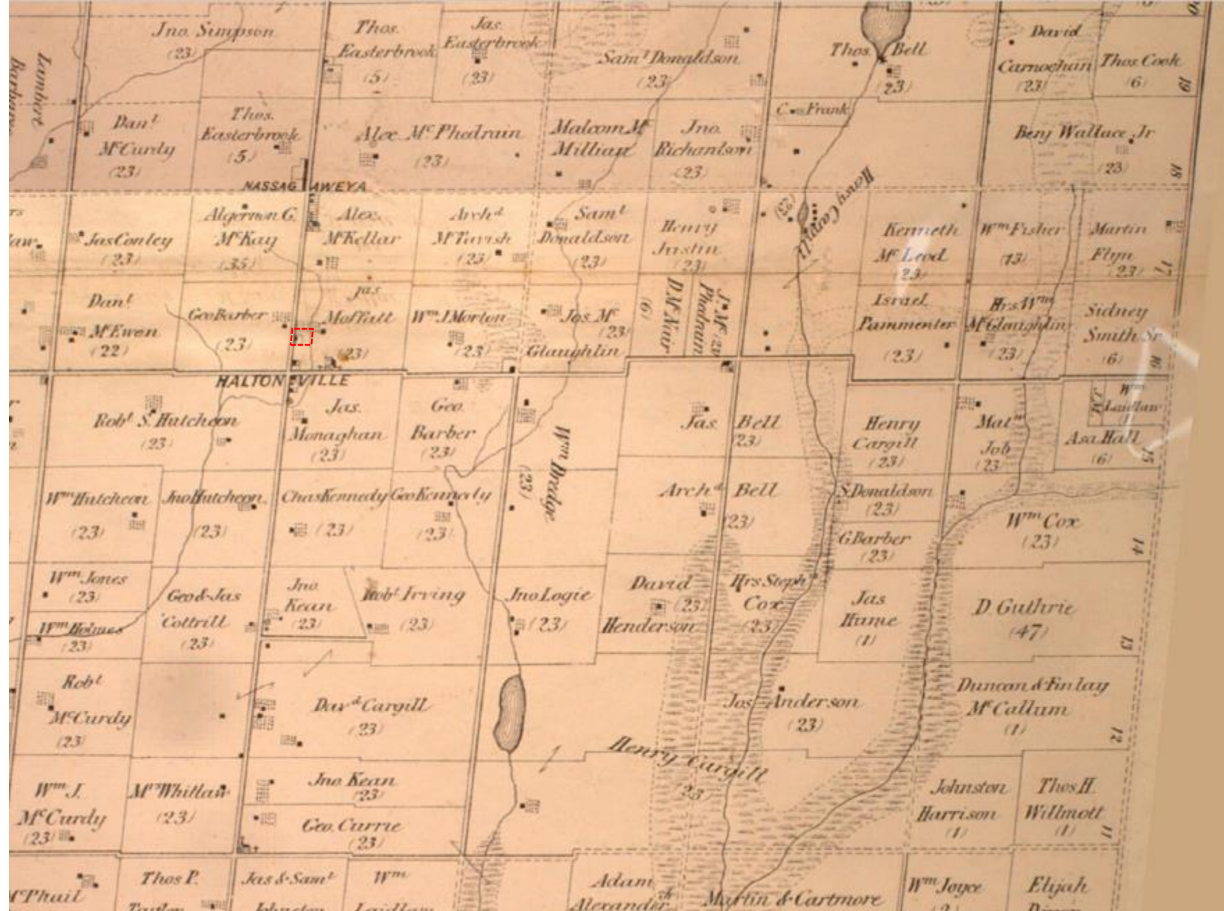
Map of Nassagaweya Historical Atlas of Halton County Ontario Illustrated Walker and Miles Toronto 1877 Map