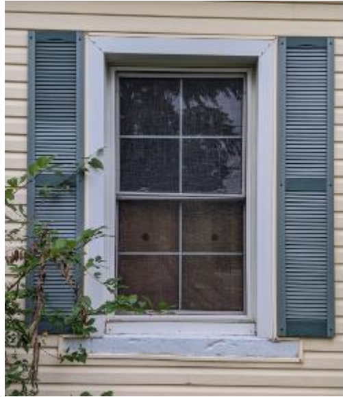
Front Elevation Window