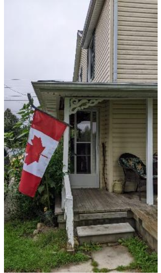
Rear Porch Entrance