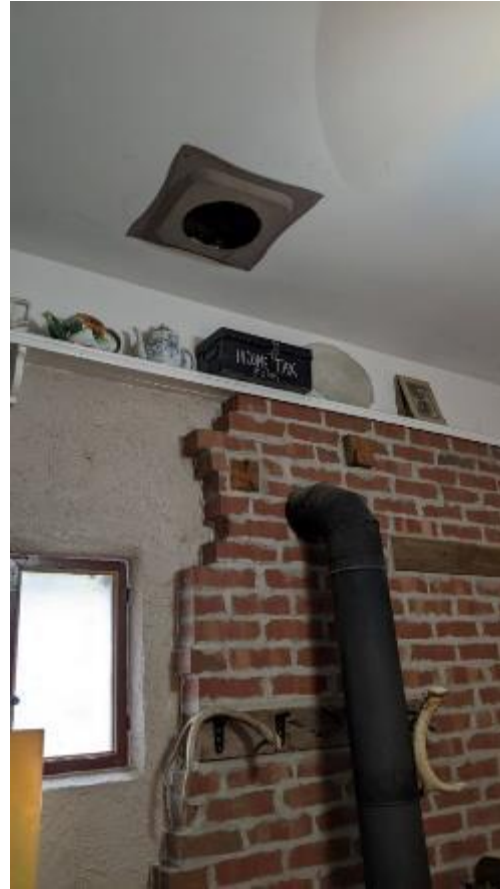
Wood Burning Furnace