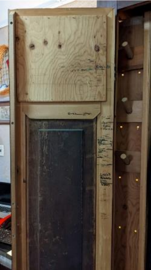
Children height markers