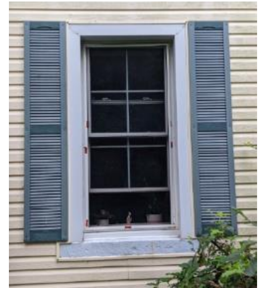
North Elevation Window