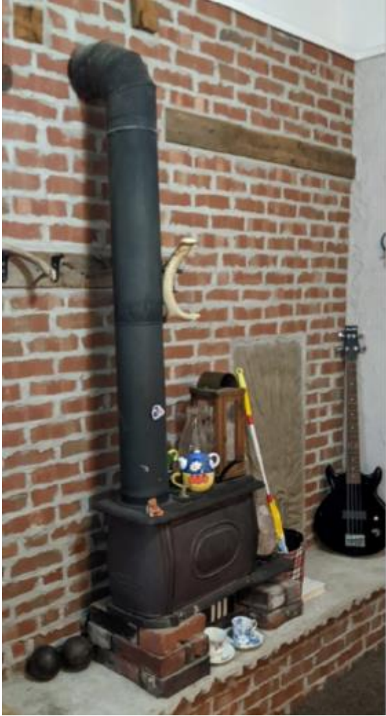
Front Elevation Window