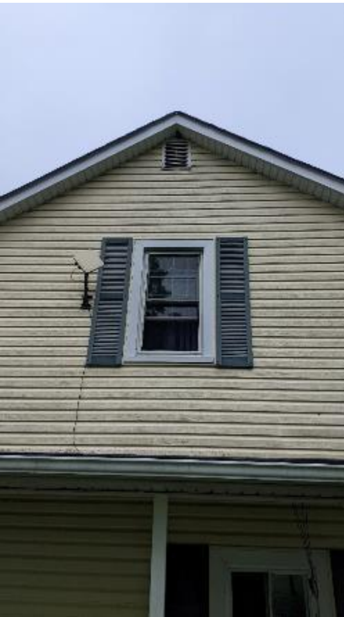
Upper floor Window