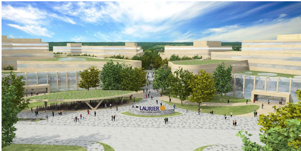
Wilfrid Laurier Campus rendering

Coordinated land planning work with the landowner group has continued with particular focus on the Sub-Watershed Impact Study (SIS). During its development and review landowners have continued to refine their neighbourhood and campus masterplans.