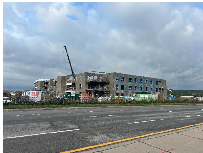
Schlegel Villages - Village of Ridgeview Court development