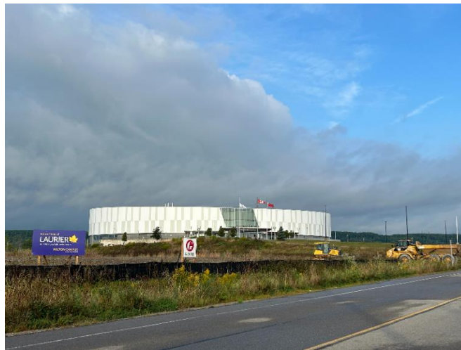
Wilfrid Laurier - Milton One site readiness activities

2024 has seen Wilfrid Laurier University continue with their site works to prepare for a future ground-breaking while Schlegel Villages has commenced construction and broken ground on phase one of their Villages of Ridgeview Court Long Term Care/Independent Living Facility.