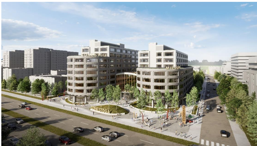
Conestoga College building rendering