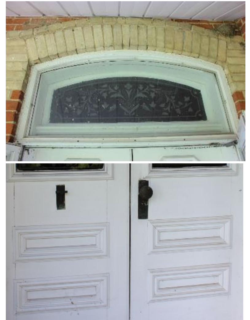
Arch Transom and Lower Door Panels details