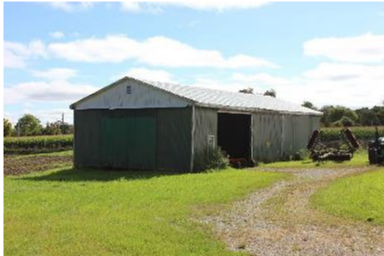
Accessory Building _ Shed 3