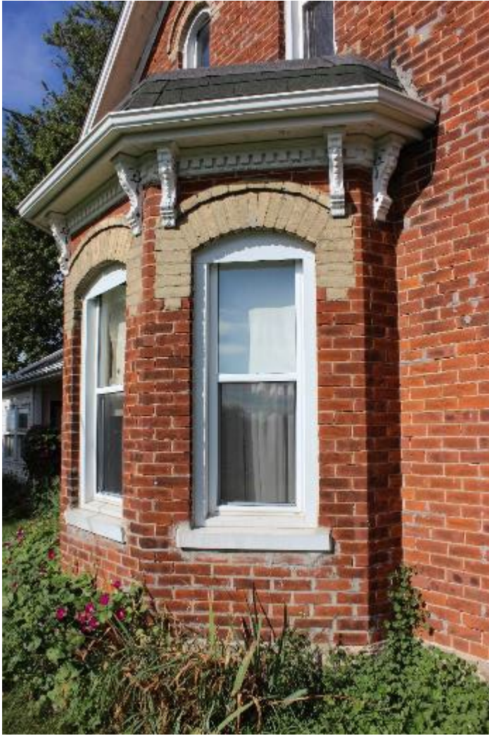
Bay Window at East Elevation

Box Bay Windows at South and East Elevation with one over one windows, brackets, moulded fascia, radiating buff brick voussoirs and stone lug sills