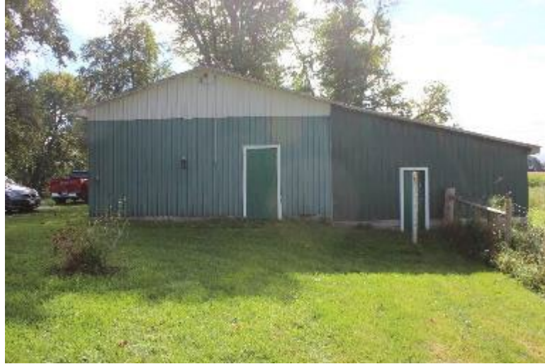
Accessory Building _ Shed 1