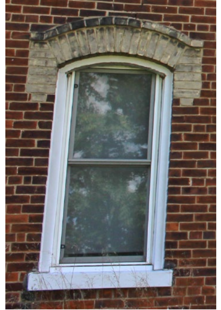
Windows at Ground Floor _ North Elevation