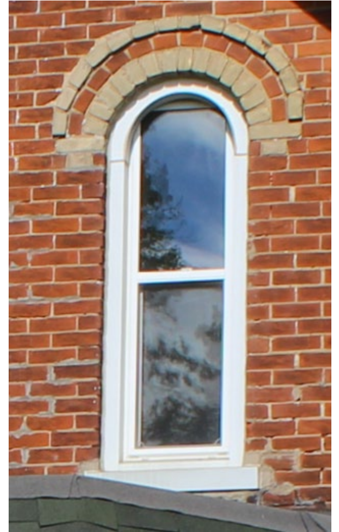
Windows at Second Floor _East Elevation