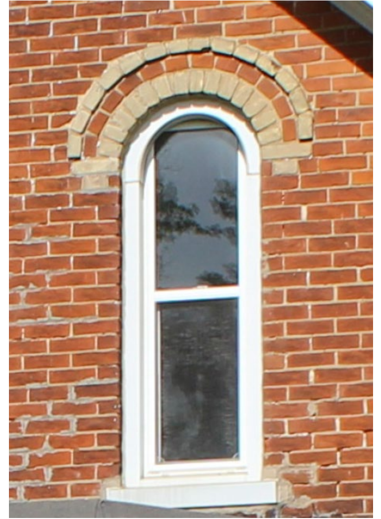
Windows at Second Floor _ South Elevation