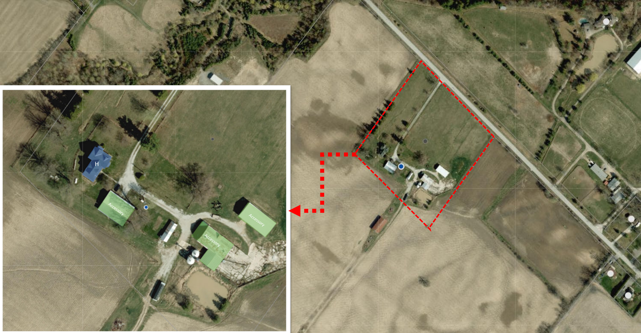
Location Map_ 6426 Sixth Line, Trafalgar