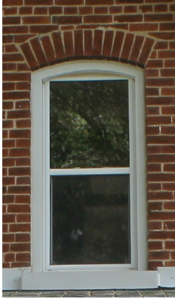
Window on Second Floor _ West Elevation