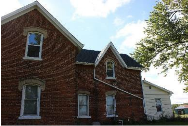
View From West

One storey addition with Lean to roof, horizontal aluminum sidings, aluminum windows and doors.