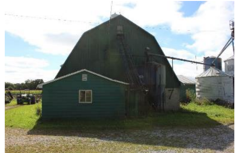
Accessory Building _ Shed 4