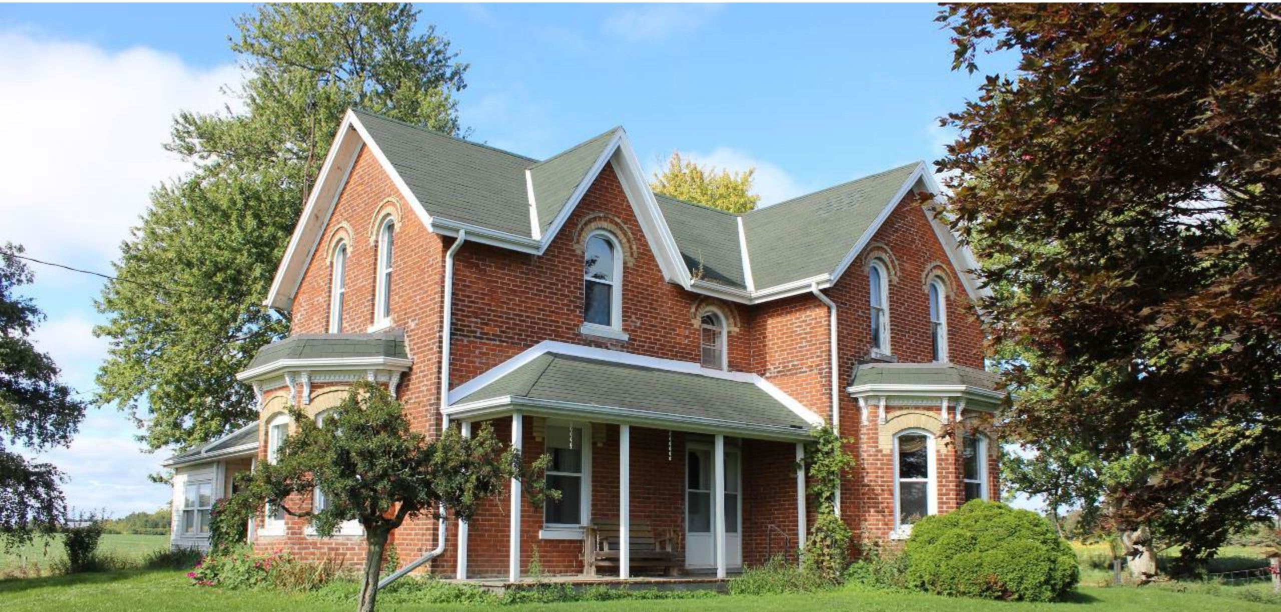
Appendix 3 Photographic Record _ Heritage Attributes _ 6426 Sixth Line, Trafalgar