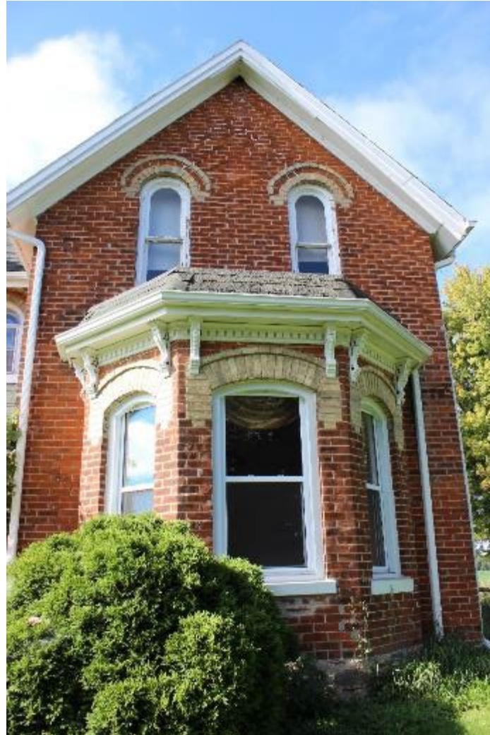
Bay Window at South Elevation