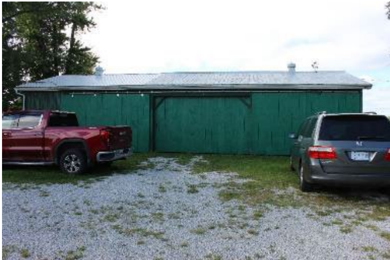
Accessory Building _ Shed 2