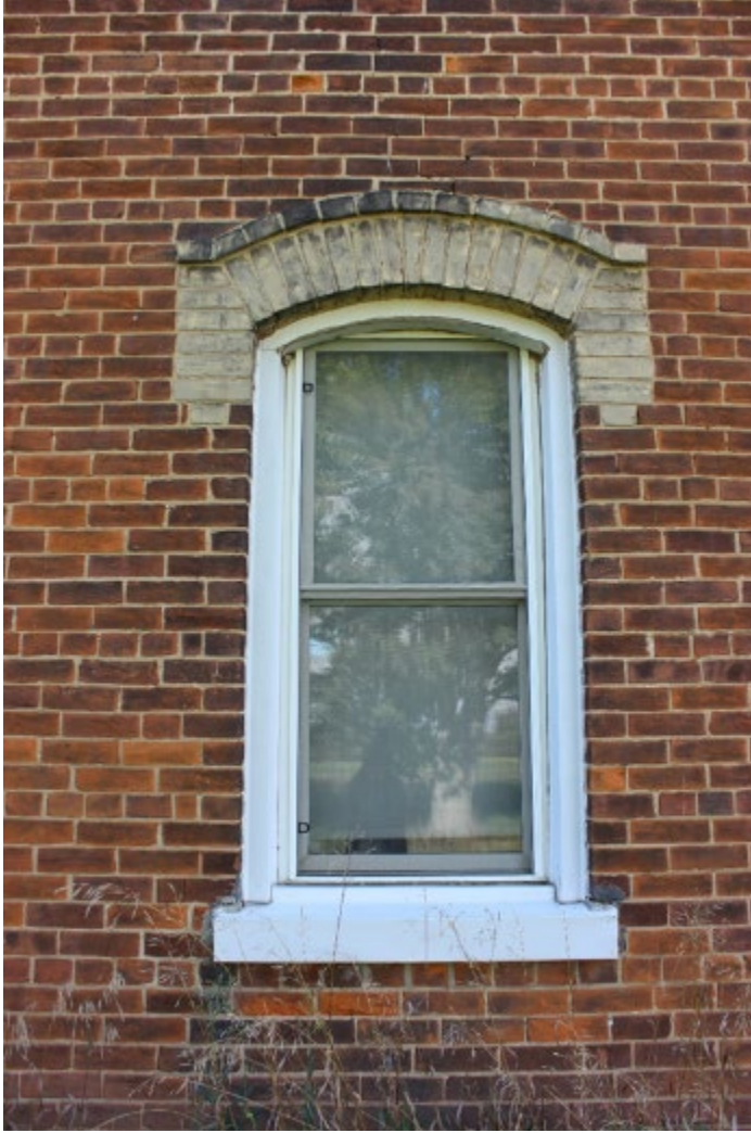
Windows on Ground Floor_ North Elevation