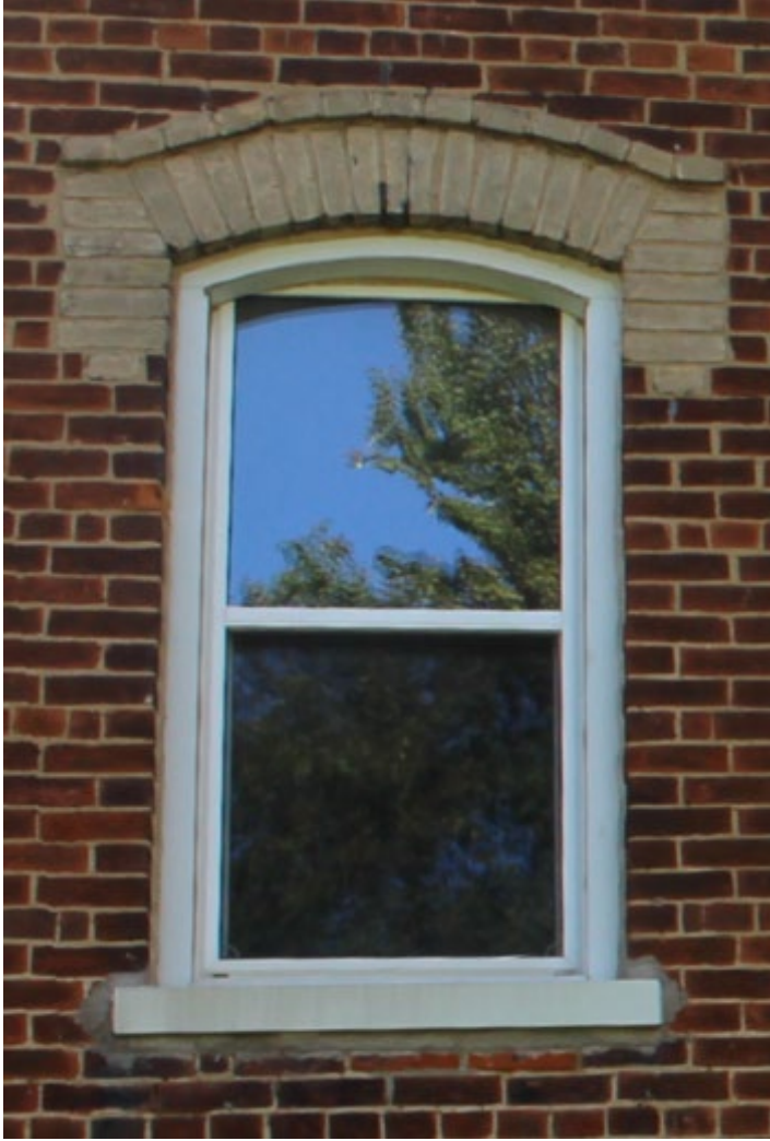
Windows at Second Floor _ North Elevation