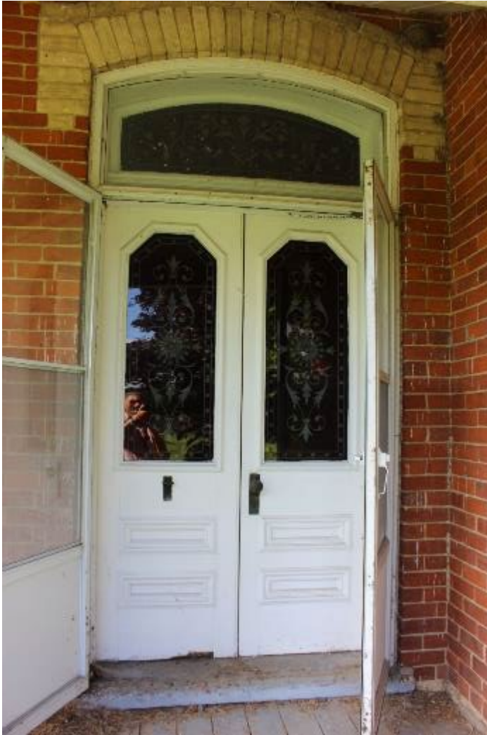
Double leaf three panels door

Double leaf three panels door with upper panel pattern glass insert, arch transom and radiating buff brick voussoirs