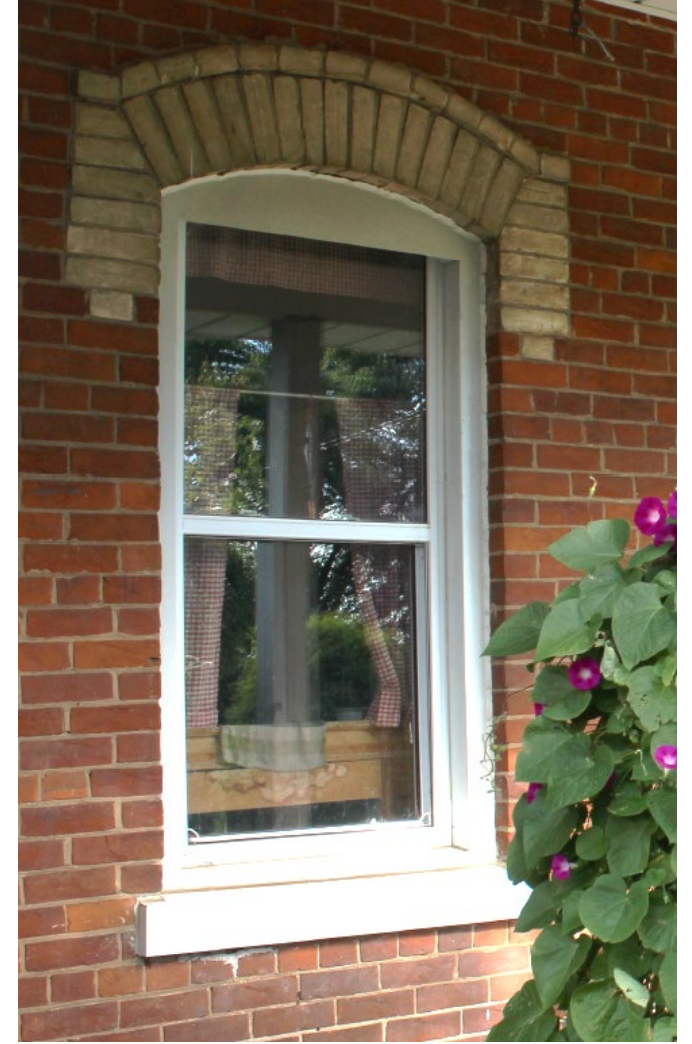
Window on Ground Floor _ East Elevation