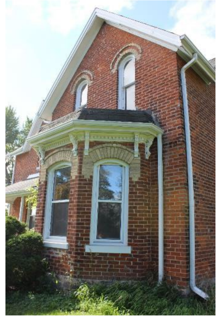
Bay Window at South Elevation