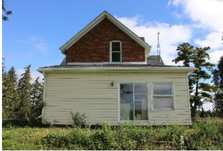
View from South